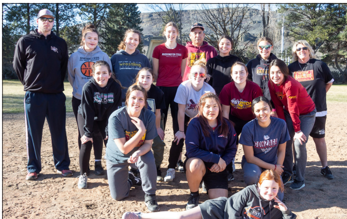
SCOTT HUNTER | The Star