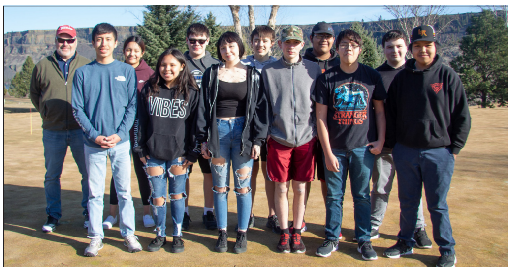
SCOTT HUNTER | The Star