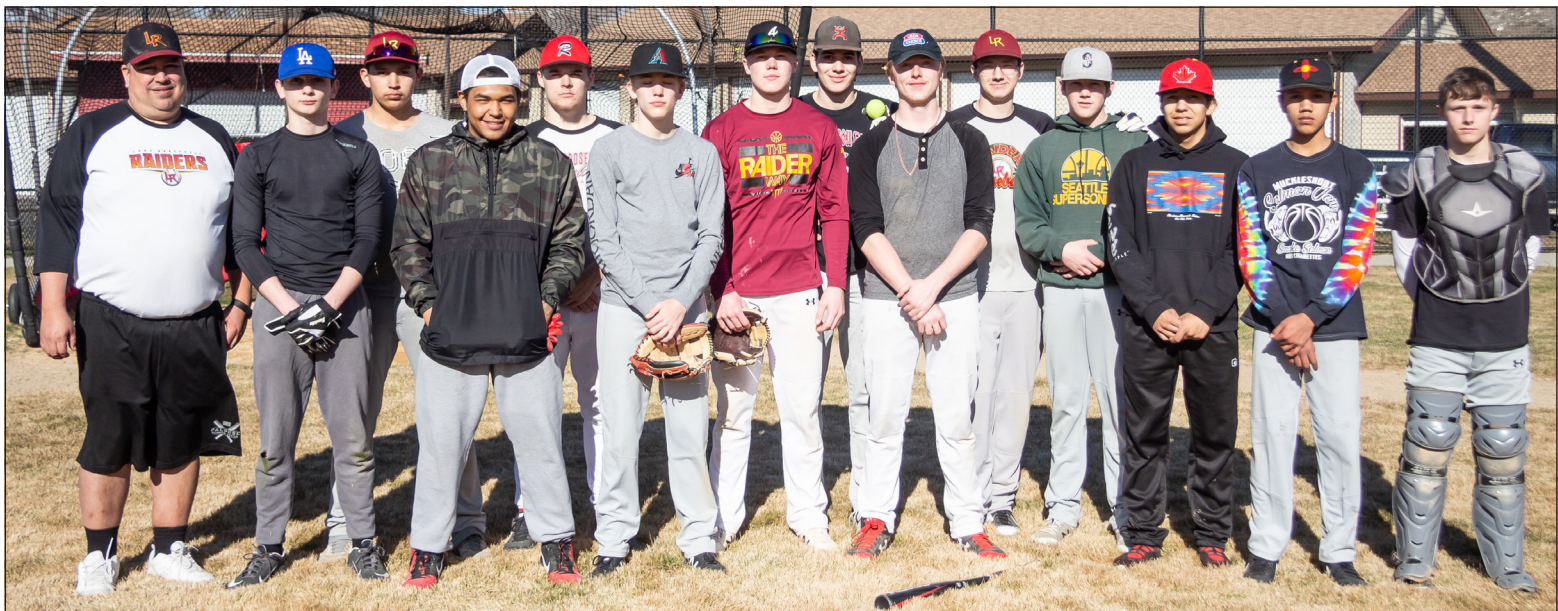
SCOTT HUNTER | The Star