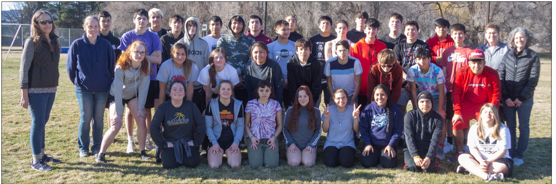
SCOTT HUNTER | The Star