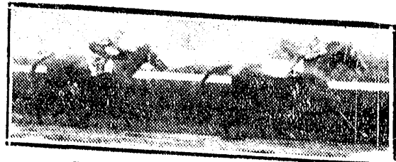
Colt Omaha Wins Belmont Stake