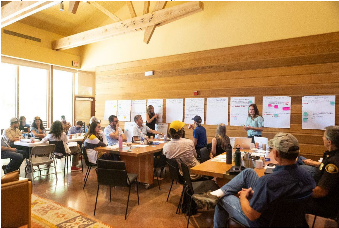
Figure 1 Stakeholder Engagement in 2022