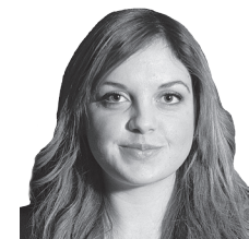
Kassie McClung @OCollyFeatures

A funding shortage that will call for a $1.8 million budget drop will require staff cuts and restructuring in Stillwater Public Schools. The plan to cut costs includes omitting about 40 teaching positions and a modified block schedule for Stillwater High School. The new block schedule would save the district about