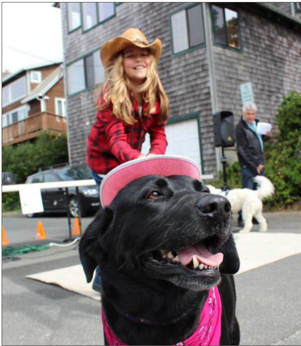
File photo of the pet fashion show.

"The city could get behind an effort with Dan Haag and the business community to set up some sort of online donation site or