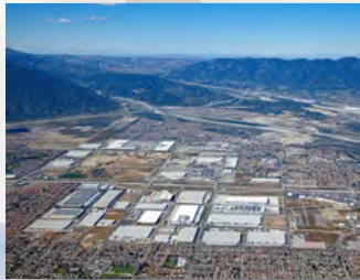
RENAISSANCE RIALTO, CA