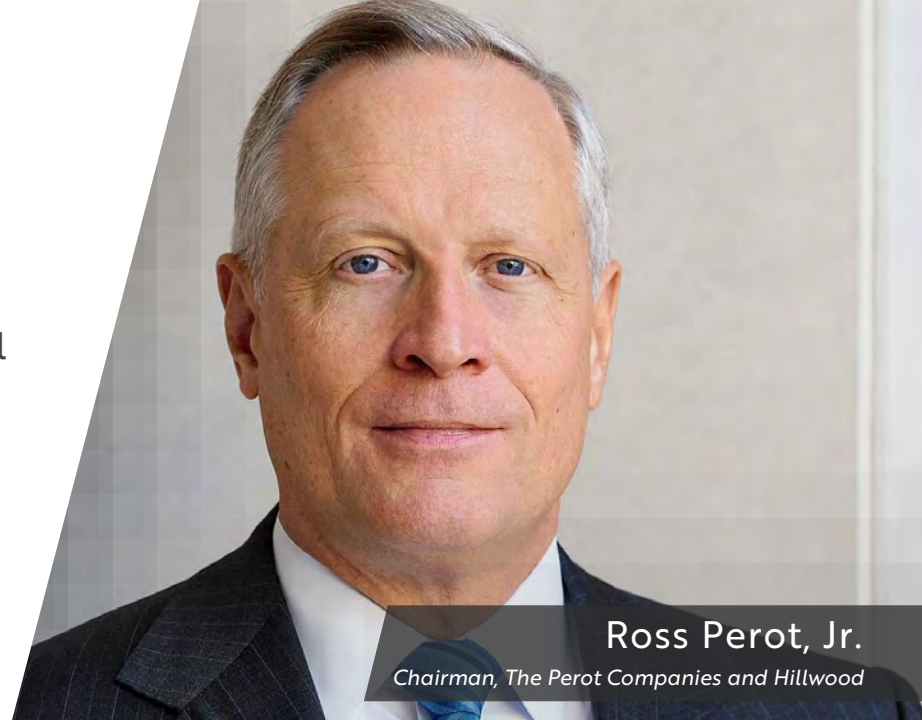
Ross Perot, Jr.

Chairman, The Perot Companies and Hillwood