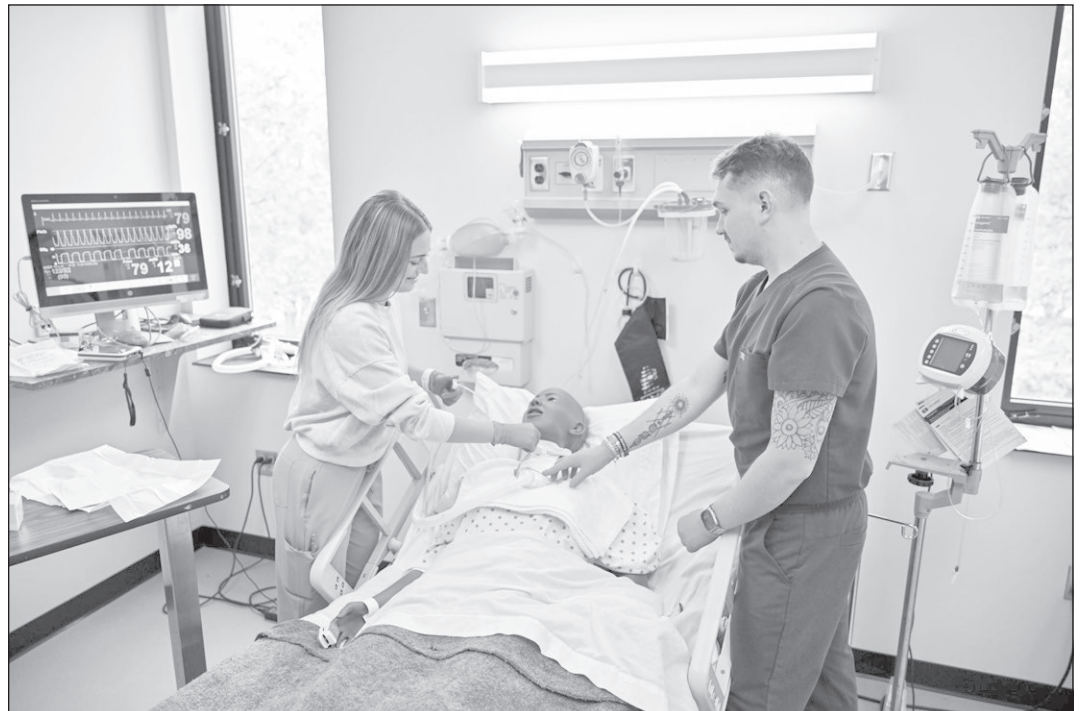
SUNY Canton students work with a computer-controlled patient in a simulation lab. Last month, the college received nearly $358,000 from the State University of New York's 2025 High Needs Nursing - Supporting Innovation & Partnerships funding.

The second initiative establishes a partnership between SUNY Canton and the Syracuse Educational Opportunity Center to deliver SUNY Canton's Practical Nursing program near the East Adams Neighborhood. Demand for this program currently exceeds capacity in the area. The program would offer virtual instruction, with labs, simulation, and clinical experiences provided locally. The program is expected to enroll 20