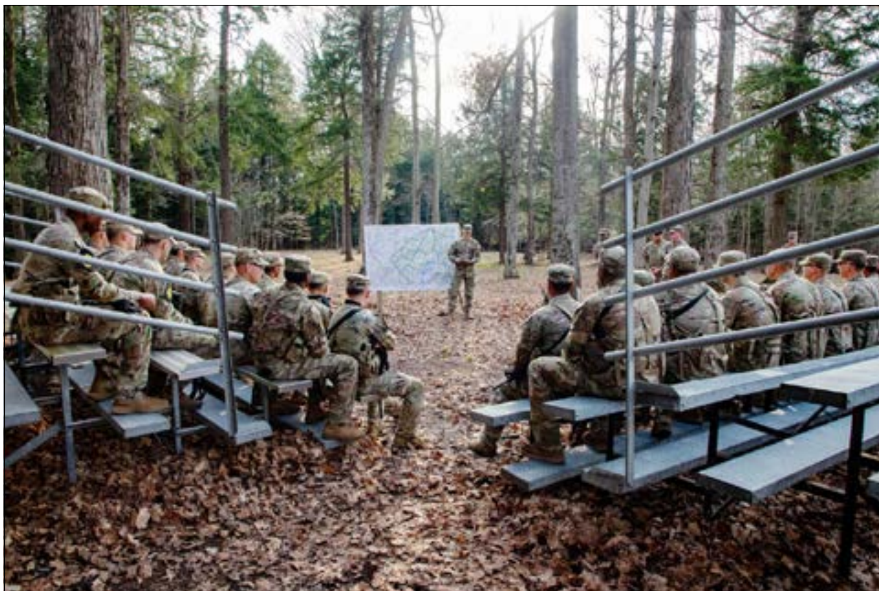
U.S. Army soldiers assigned to the 10th Mountain Division compete in the XVIII Airborne Corps Best Squad Competition.

Each squad, consisting of five Soldiers, must demonstrate not only individual excellence but also seamless cohesion as a team. Every member plays a critical role, and