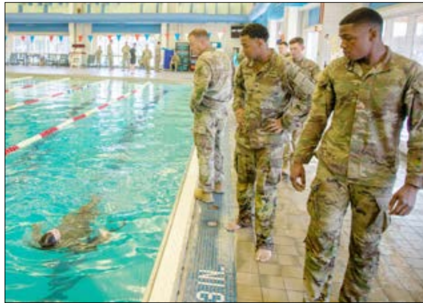
The XVIII Airborne Corps Best Squad Competition required competitors to navigate aquatic obstacles while wearing full combat uniform and gear to simulate real-world operational challenges.