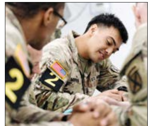
U.S. Army soldiers assigned to the 10th Mountain Division complete a 56-question written examination immediately following a 12-mile ruck march during the XVIII Airborne Corps Best Squad Competition.

Above: U.S. Army soldiers assigned to the 10th Mountain Division push through an expert physical fitness assessment at Fort Drum on April 23. During this phase of the XVIII Airborne Corps Best Squad Competition, soldiers were measured against demanding standards to determine their ability to sustain peak performance during prolonged physical exertion.