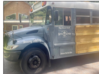
Phineas, a food-truck certified school bus, is ready to serve up some of the Seaway Smokehouse’s “good stuff” at any event.

Tucked away on the east branch of the Oswegatchie River in Wanakena, the SUNY-ESF Ranger School offers more than a degree — it provides a hands-on education in the heart of the Adirondacks. Established in 1912, the school is affiliated with the State University of New York College of Environmental Science and Forestry. Students