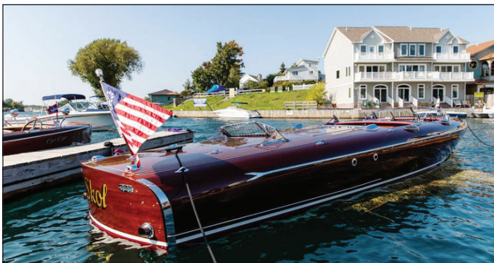
Skol, a 1939 Fitzgerald & Lee runabout with triple cockpit, won best in show at the 2019 Antique and Classic Boat Society’s annual international boat show held in Alexandria Bay. The ACBS annual gathering returns to the Thousand Islands next week, to Clayton, during a week of events co-hosted by the Antique Boat Museum.