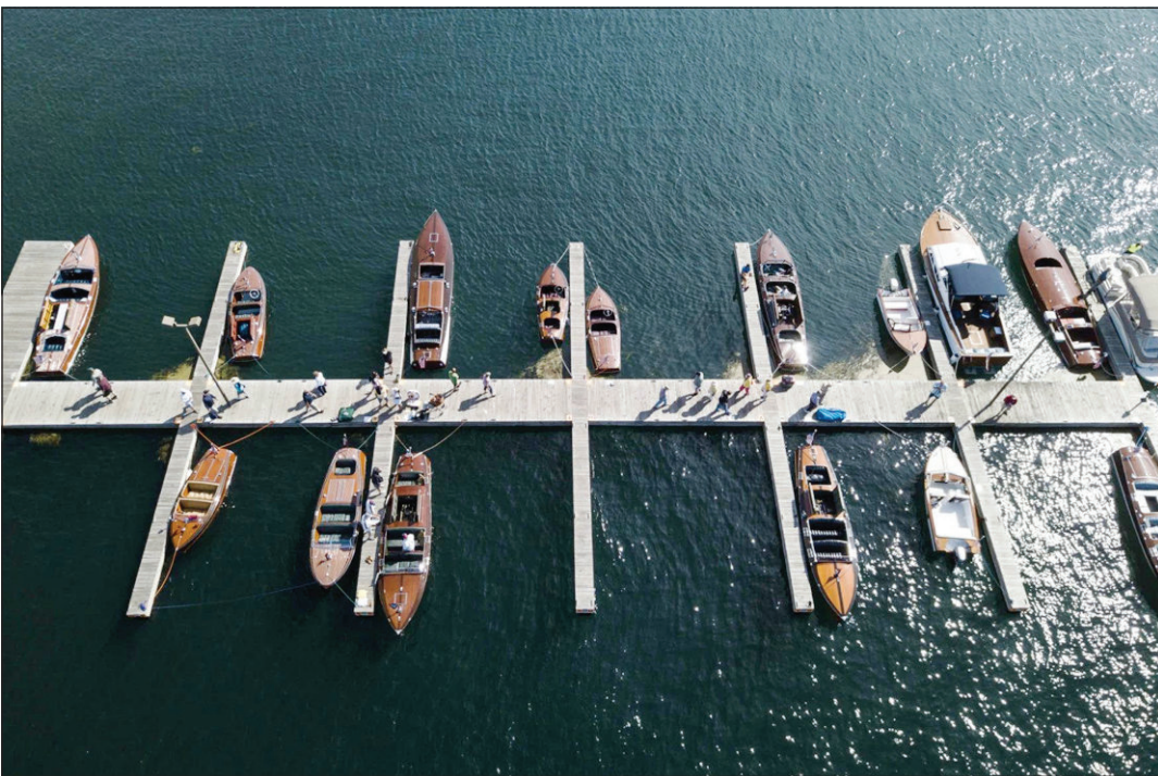
Boats in the Antique and Classic Boat Society’s International Boat Show are docked on Sept. 19, 2019, at the Upper James Street Dock in Alexandria Bay.