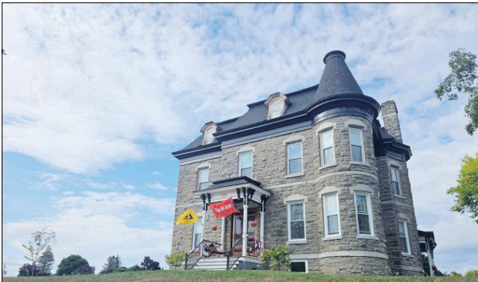
Claire House is a former rectory turned Bed and Breakfast that has been featured on the Ghost Hunters TV show.

CANTON — The St. Lawrence County Chamber of Commerce continues to grow with the addition of six new members in August.