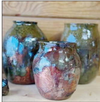
Some of the results of a recent raku firing at Nathan Cox’s Red Barn Pottery studio in Brushton.

At Seaway Smokehouse and Catering , 11421 State Route 37, Lisbon, the approach is simple: exceptional food, generous portions, great people, and attention to detail. Now in its 18th year, the Seaway Smokehouse and Catering offers an in-house restaurant menu serving southern BBQ, a robust char-grill menu, and elevated classics that will please all palates. When it