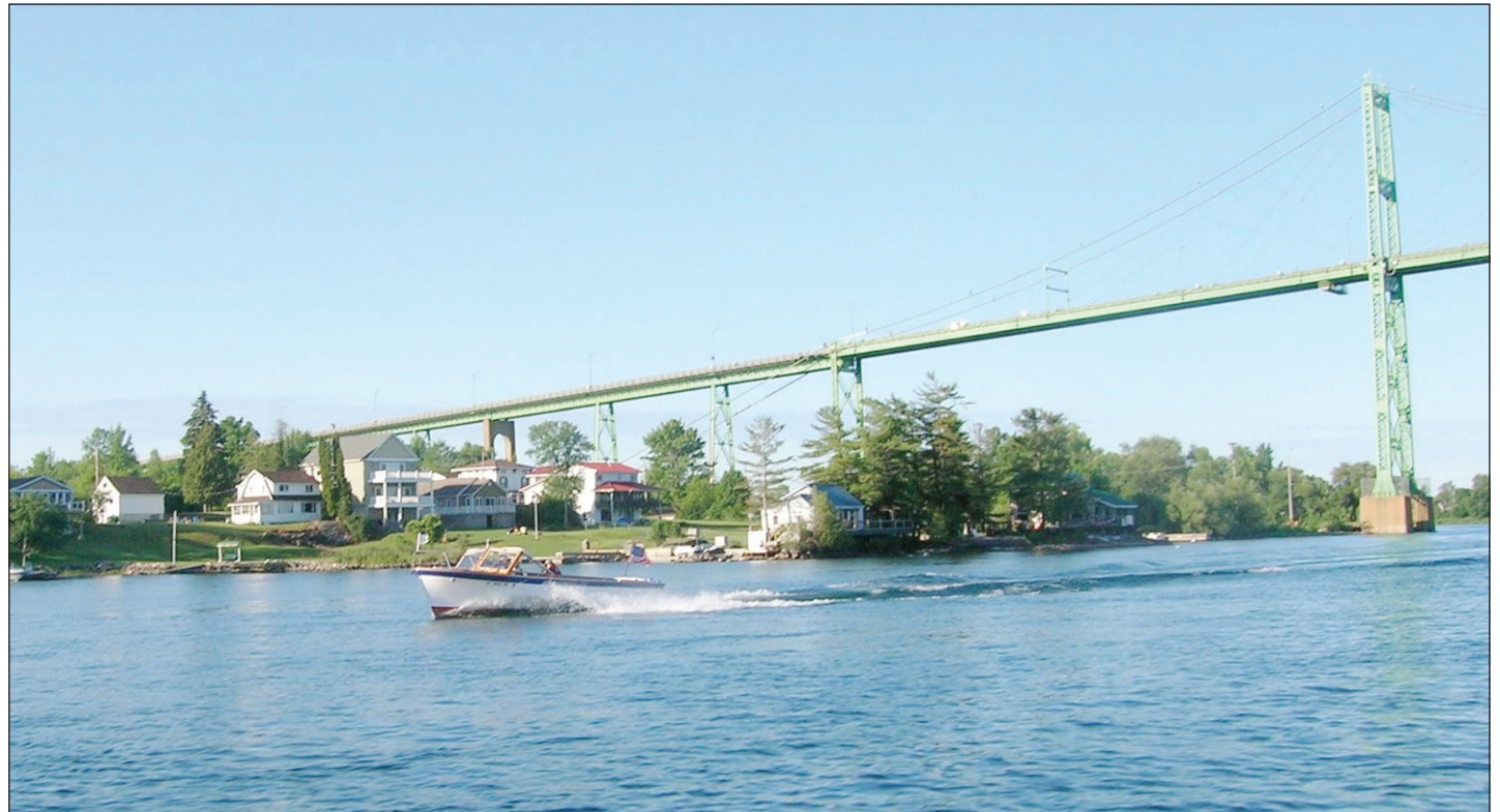
This photo from 2021 at the local chapter gathering shows a craft near the Thousand Islands International Bridge. Local chapters of the Antique and Classic Boat Society hold annual gatherings. There are 52 chapters. The Thousand Islands chapter usually meets in Alexandria Bay.

The local Thousand Islands chapter of the ACBS contains members from the U.S. and Canada. The chapter hosts several events throughout