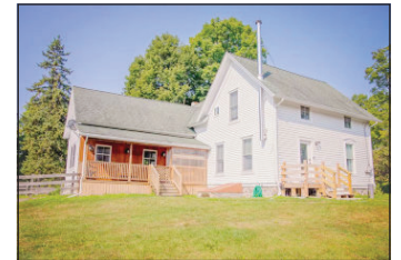
Willow View Property offers a tranquil setting with enough room for 10 on the outskirts of Canton. Photo provided

equipment. There is more information on Signal Stream at signalstream.ca .