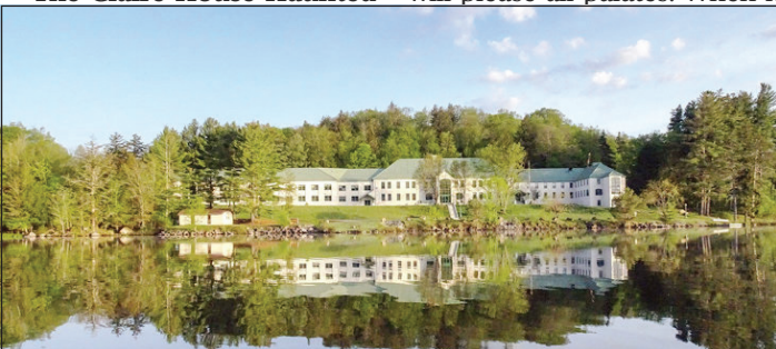
SUNY ESF Ranger School.

Bed & Breakfast , 709 Franklin St., Ogdensburg, offers a chance to step back in time. The historic bed and breakfast was famously featured on the Ghost Hunters TV show. Guests enjoy the charm of a beautifully preserved Victorian home, cozy accommodations, and a touch of the unexplained. Whether guests come for the history, the hospitality, or the haunted happenings, The Claire House offers a one-of-a-kind stay that blends comfort with curiosity.