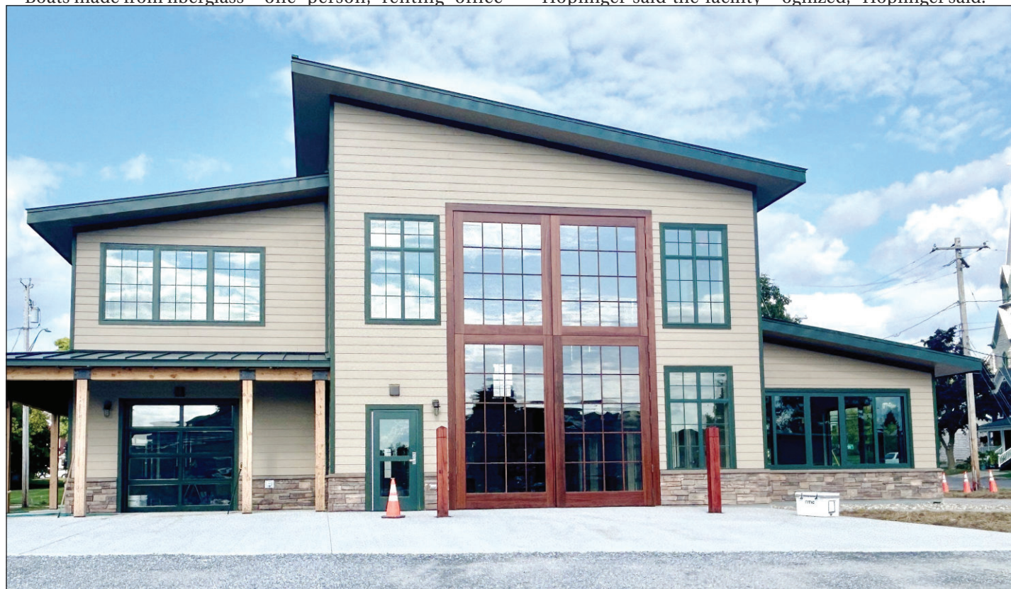
The timing of the ACBS gathering coincides with the final stages of construction of the Antique Boat Museum's new boat shop facility. The closing reception will serve as its unofficial opening.

"And every place in between," she added. "With this being our 50th anniversary, we have members coming from our France chapter and our Northern European chapter. They aren't bringing boats, but they are coming to partake in the festivities and to see the Thousand Islands."