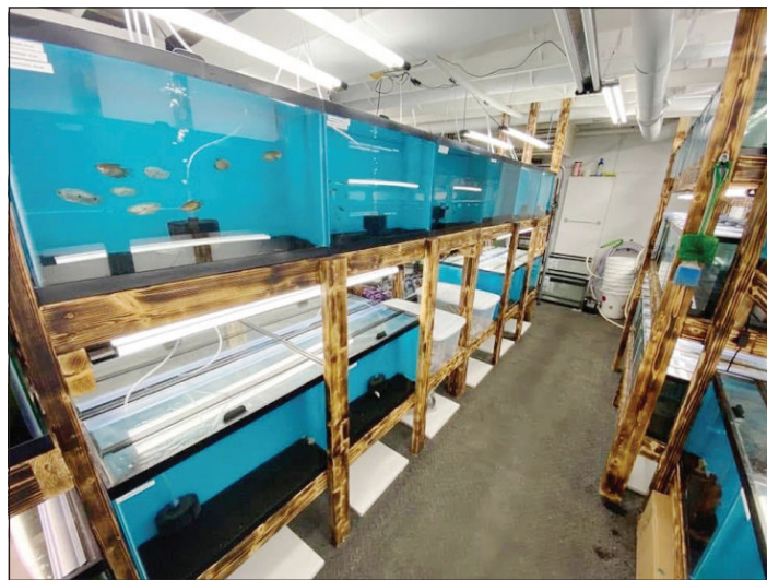
Potsdam Aquatics offers freshwater fish, tanks, and supplies located at 1122 State Highway 11B, Potsdam.