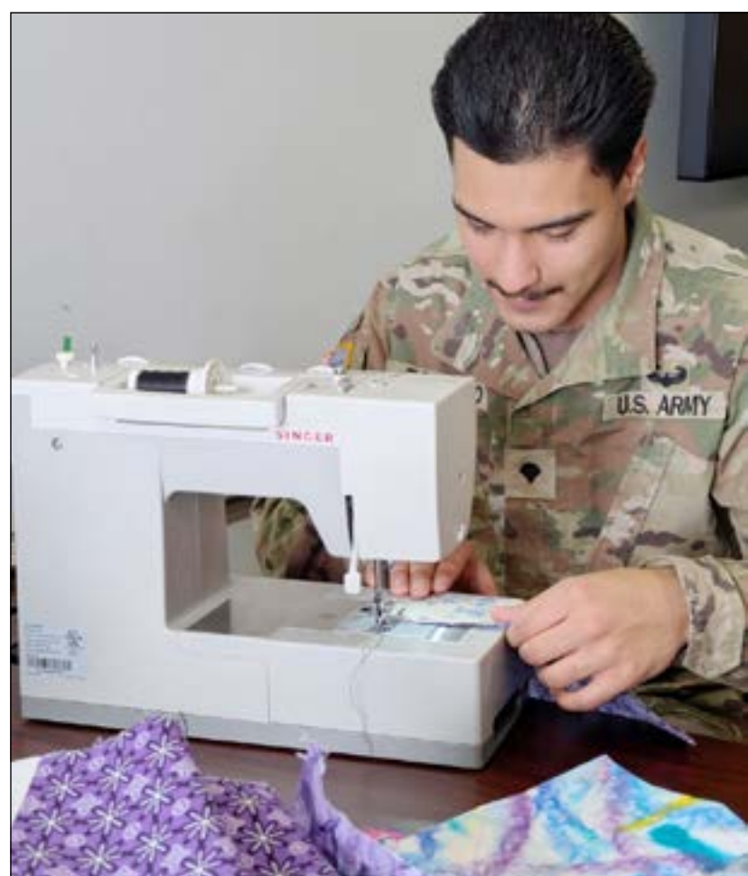
Fort Drum soldiers and family members receive hands-on instruction during the Relocation Readiness Program's Stitching The Standard class on Feb. 24 inside the Family Resource Center. The free class is designed for soldiers to learn how to make adjustments and repairs to their uniforms, as well as patch and rank replacement.