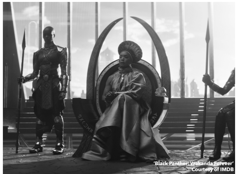
'Black Panther: Wakanda Forever'