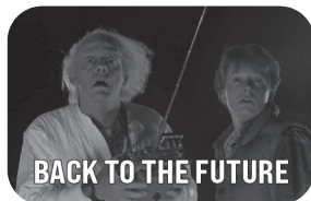
BACK TO THE FUTURE