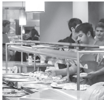
Students at Crown Commons