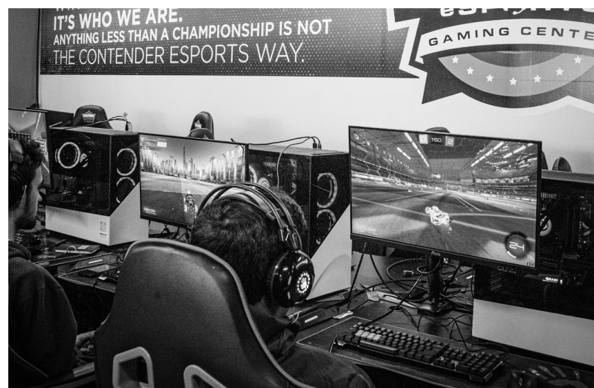
Charlotte's Niner Esports at the Contender Clash on Nov. 12