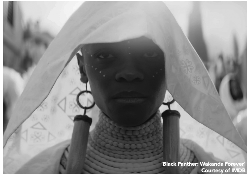
'Black Panther: Wakanda Forever'