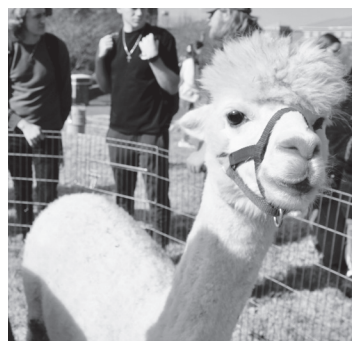
Alpaca at AMA fundraising event