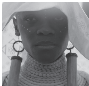
'Black Panther: Wakanda Forever'