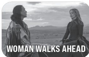
WOMAN WALKS AHEAD