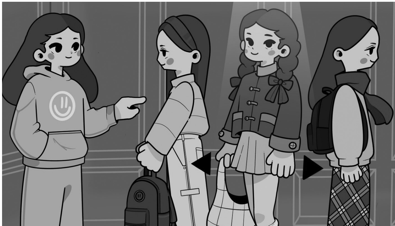
Rue Thi/Niner Times

in the library or grabbing dinner in the dining hall. Puffer vests and flannels are versatile additions that can be layered over hoodies or your favorite athleisure top with leggings or pants, giving you an effortlessly stylish vibe. Embrace leather jackets for a sleek appearance on a night out, or opt for the sophistication of a knit sweater or cardigan to give you that bookish, academic look. Trench coats are back in and are not just for battling this bitter cold; they add a polished touch to any outfit. Further, explore the preppy