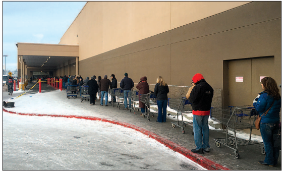
The line of shoppers waiting to enter Sam’s Club on Saturday stretches the length of the building. But it was moving fairly quickly, and after about a 15-minute wait, shoppers were able to enter.