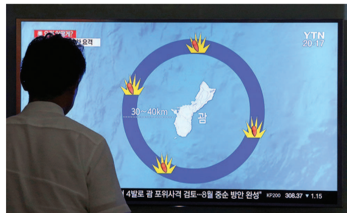
A man watches a local news program Thursday on North Korea's threats to strike Guam with ballistic missiles at the Seoul Train Station in Seoul, South Korea.