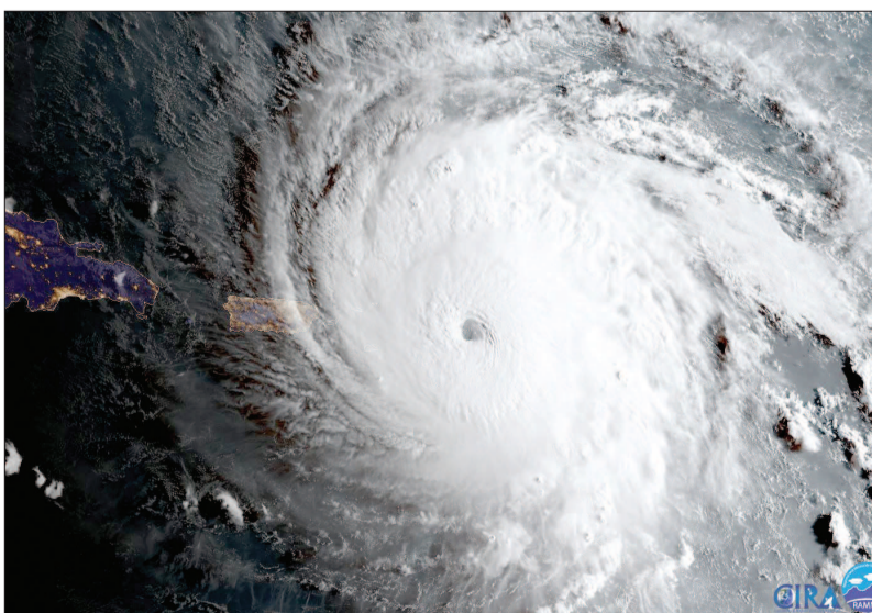
This satellite image from the National Oceanic and Atmospheric Administration shows Hurricane Irma bearing down on Puerto Rico on Wednesday. Its record 185 mph winds devastated Barbuda and knocked out power for 900,000 in Puerto Rico. For more on Hurricane Irma, see Page 5.