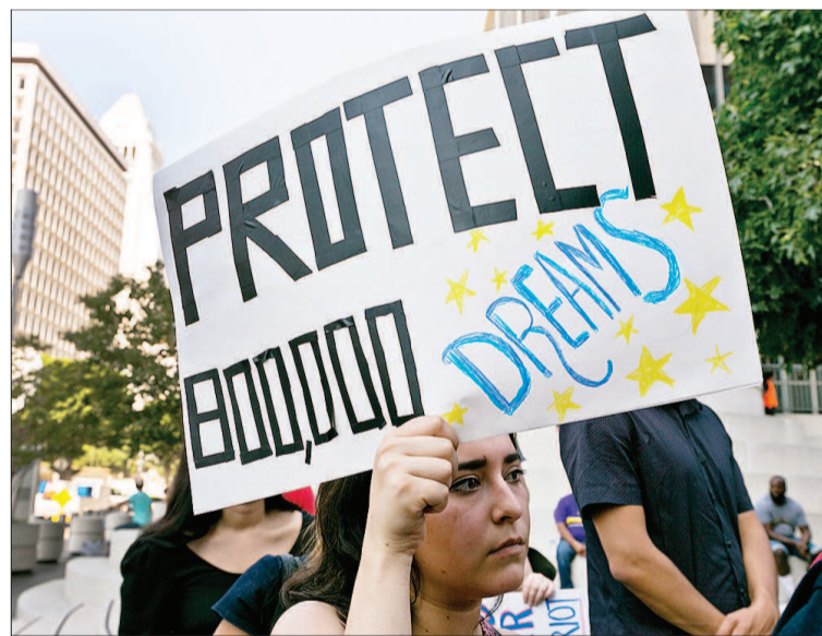
Students rally in support of the Deferred Action for Childhood Arrivals program Sept. 1 in downtown Los Angeles.