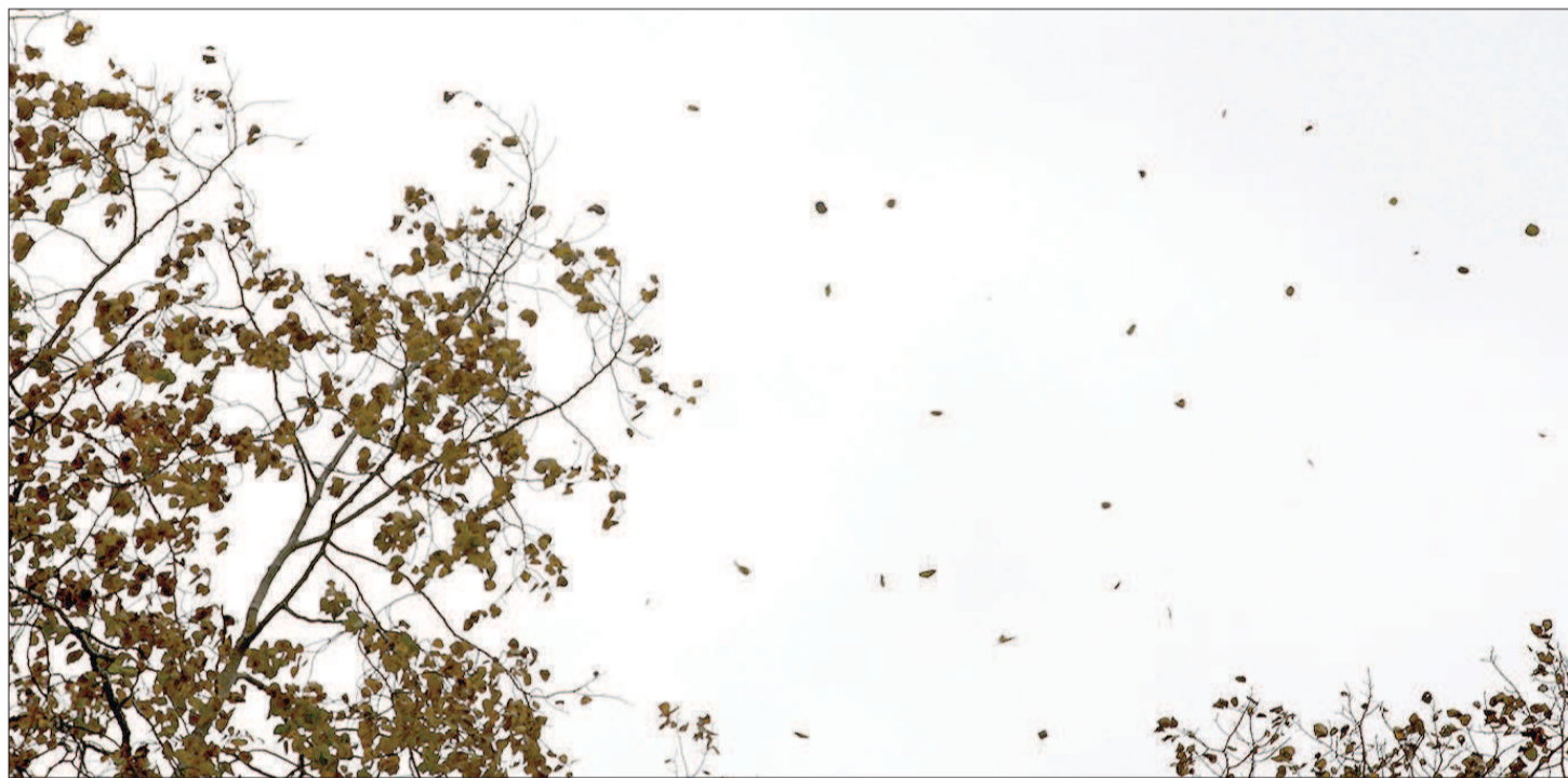
Wind blows leaves from the top of aspen trees Wednesday afternoon in the hills west of Fairbanks.