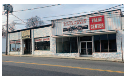
Clearance & Value Center