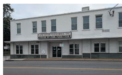
Premium Mattress, Leather, Bedrooms & Dining Centers

Mon., Tues., Thurs., 9 to 5:30 Shop 'til 7:00 Friday, Sat. 9 to 5 Closed Wed. & Sun.