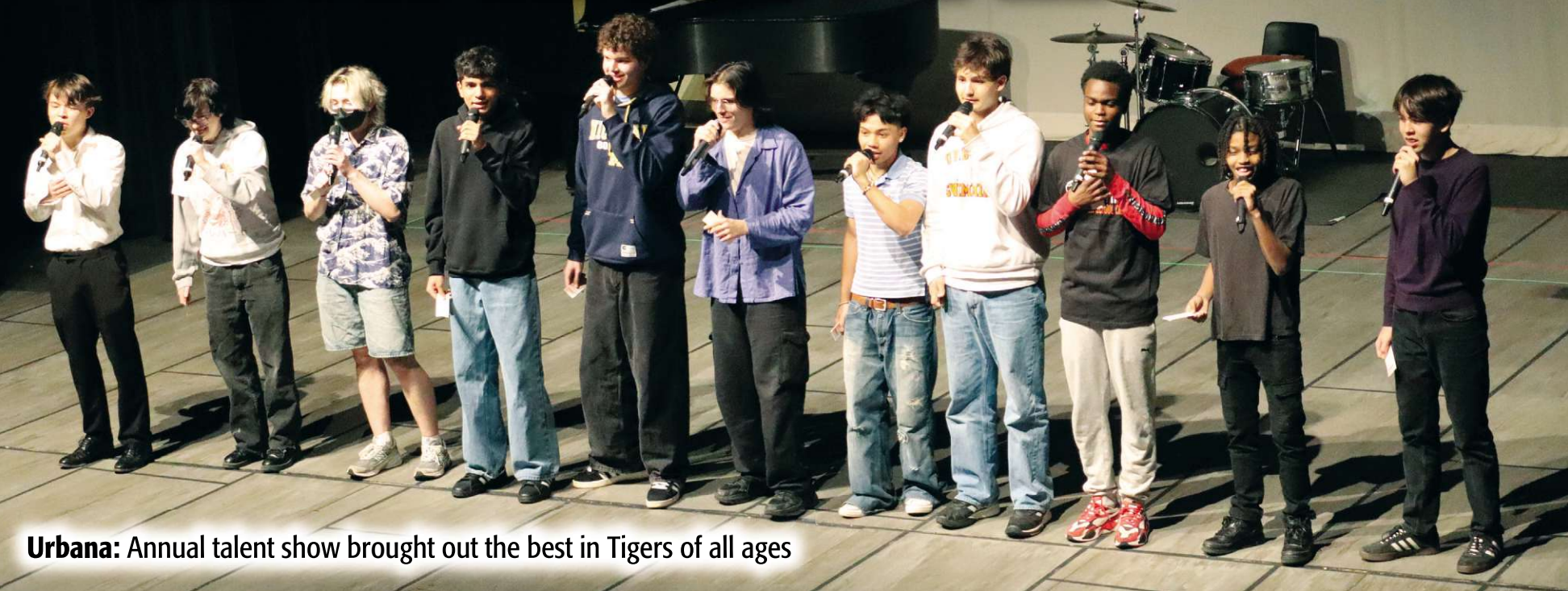
Urbana: Annual talent show brought out the best in Tigers of all ages

Powered by Danville Area Community College