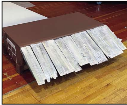
Hoopeston Area: Set design complete for this weekend's performances of 'Between the Lines'