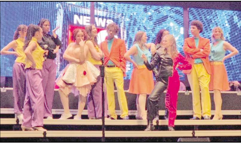
Danville: Show choirs go out in style

From spring musicals to show choirs to talent shows, these talented kids brought crowds to their feet