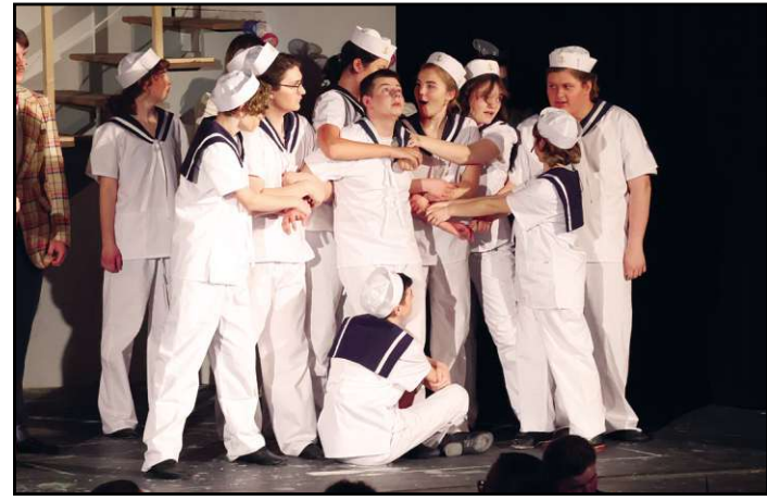
Mahomet-Seymour: 'Anything Goes' opens Friday