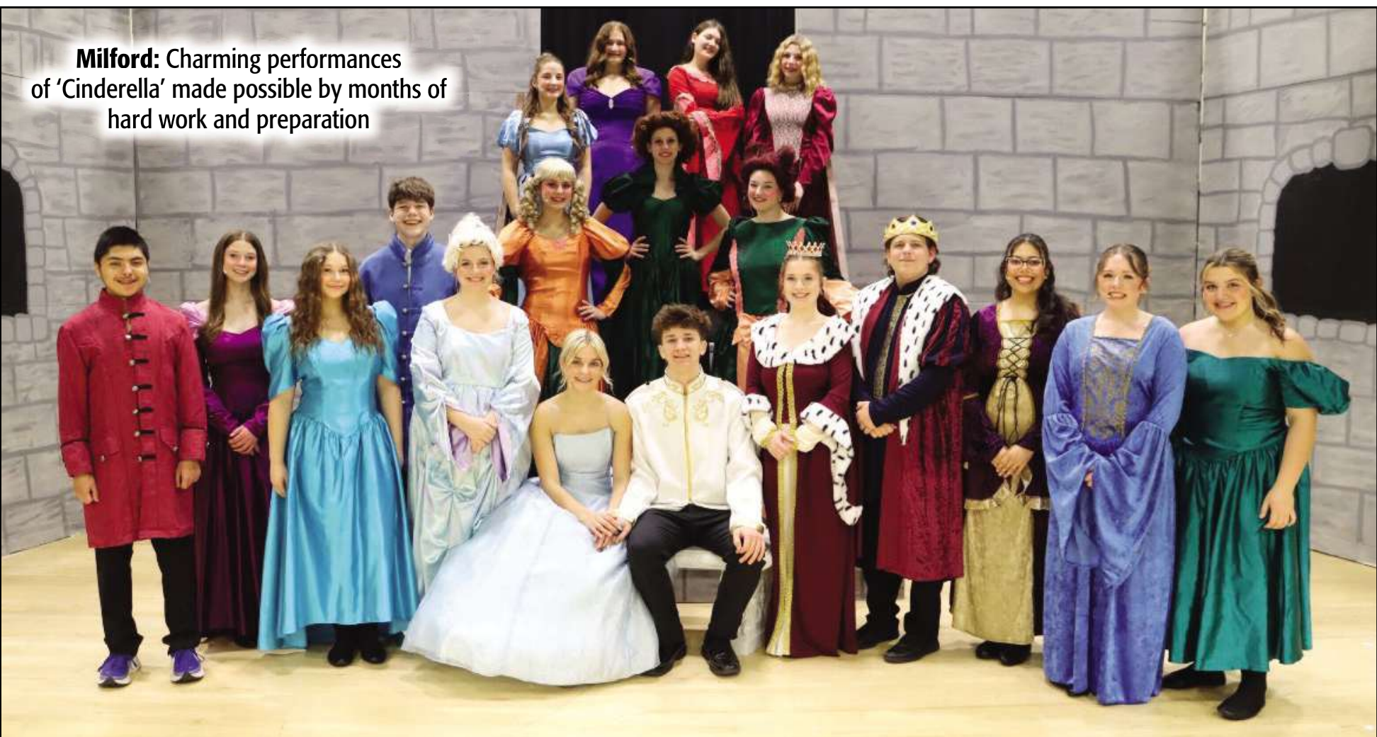
Milford: Charming performances of 'Cinderella' made possible by months of hard work and preparation