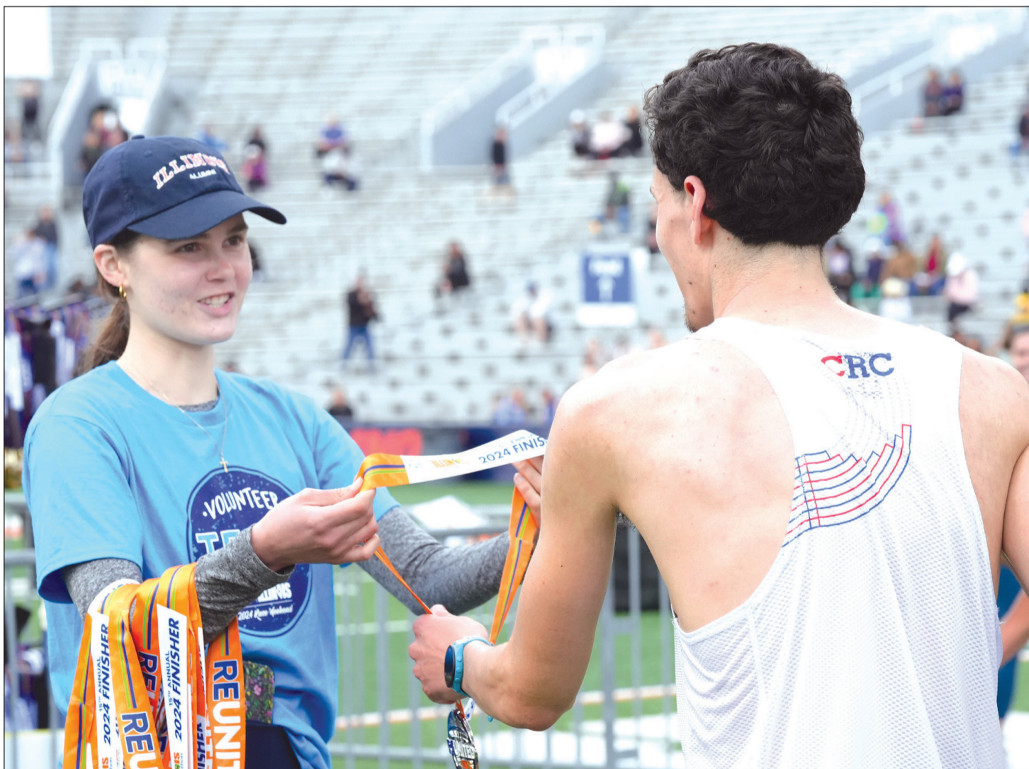
A volunteer hands a medal to a runner who completed the Christie Clinic Illinois Marathon on Saturday at Memorial Stadium.