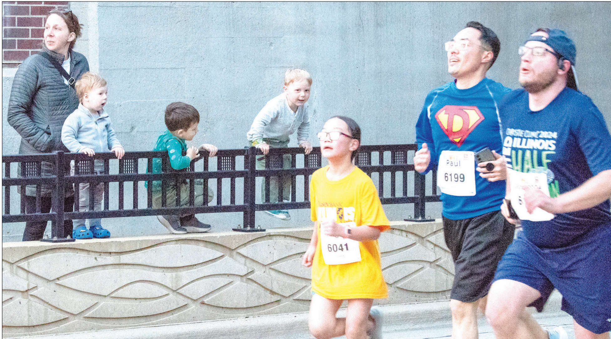
Fans cheer on participants in the Green Street Mile from the barricades under the railroad overpass near Neil Street during Christie Clinic Illinois Race Weekend on Thursday in Champaign.