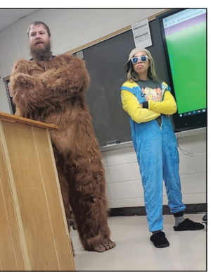
G-RF Students and staff at Georgetown-Ridge Farm dressed up for Halloween. - IZABELLA WILLS