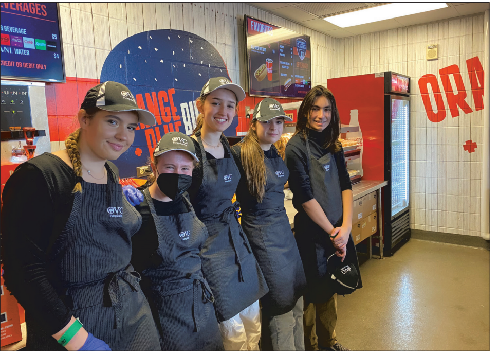
Academy High Students volunteered by working concessions at last Saturday's Illinois football game. Money raised was donated to Eastern Illinois Foodbank.