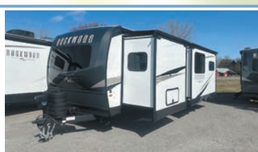
2025 ROCKWOOD ULTRA LITE 2614BS $49,495 price + tax, title & reg.