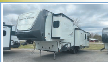
2025 ROCKWOOD SIGNATURE 375RL $73,595 price + tax, title & reg.

Enjoy all nature has to offer during Everything RV and more with the help of Hodge's Legacy RV