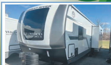
2025 WILDWOOD HERITAGE GLEN 271RL $48,495 price + tax, title & reg.

Formerly known as Whatten RV Sales...same great people, just a new name