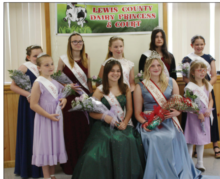
The 61st annual Lewis County Dairy Princess Pageant will be June 8. Submitted photo

The pageant includes a complimentary light lunch with cake and ice cream.