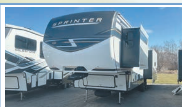
2025 KEYSTONE SPRINTER 3590 $65,998 price + tax, title & reg.