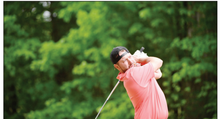
Registrations are still available for the 21st Annual Potsdam Rotary Scholarship Golf Tournament at the Potsdam Town & Country Club on May 17. Above, a player tees off in the 2023 tournament.

For more information, email golf@potsdamrotary.org .