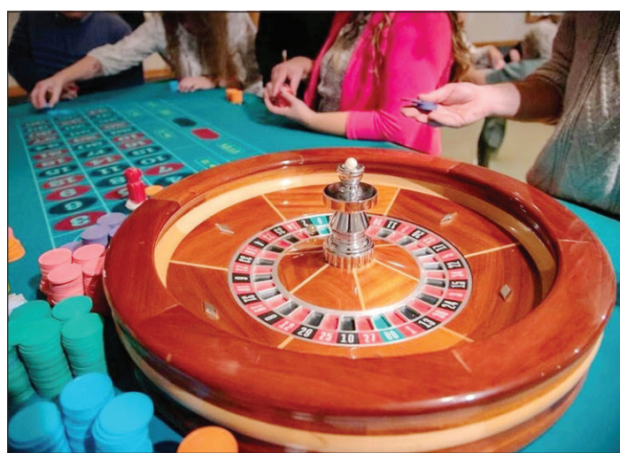
DPAO plans a charity casino night with "fun money" on May 17.

General admission tickets are $25 and will go on sale