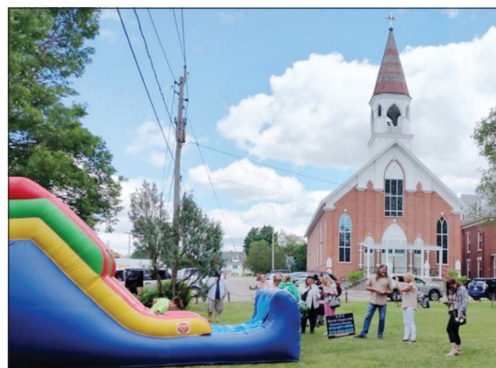
A bounce house was set up at Summer Fest 2024 for young attendees to have some fun with. This year's Malone Chamber of Commerce sponsored event will take place on June 14th at Arsenal Green Park in Malone.