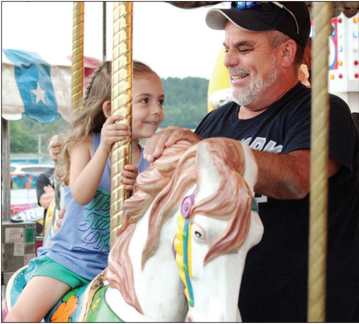
Scene from the Franklin County Fair