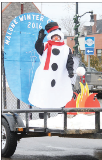
An entrant in the annual Malone Winter Carnival parade