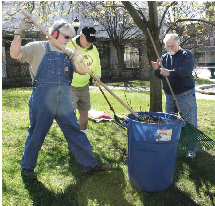
Members of American Legion Post 219 in Malone do spring cleaning in Veterans Park.