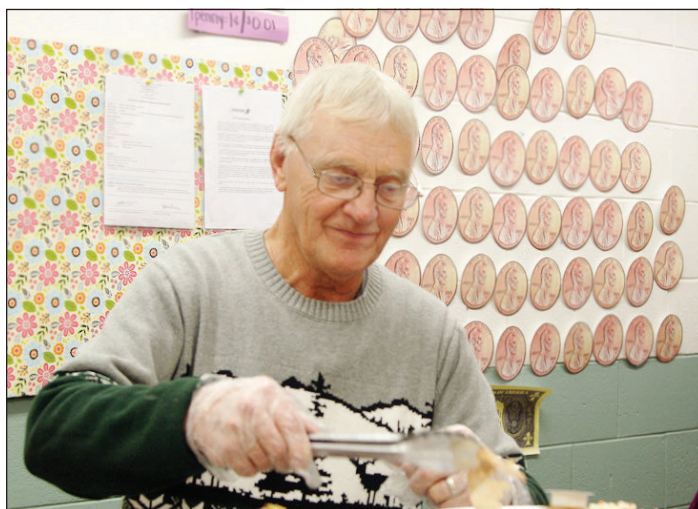
Scene from the annual Community Thanksgiving dinner in Malone.