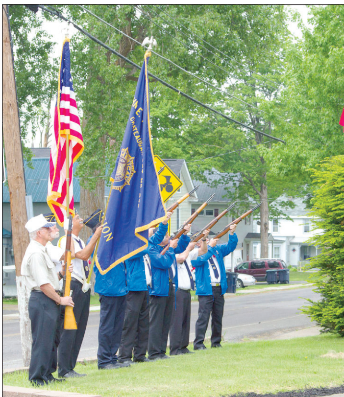
Members of the Chateaugay American legion firing squad participate in Memorial Day ceremonies in the village of Burke.