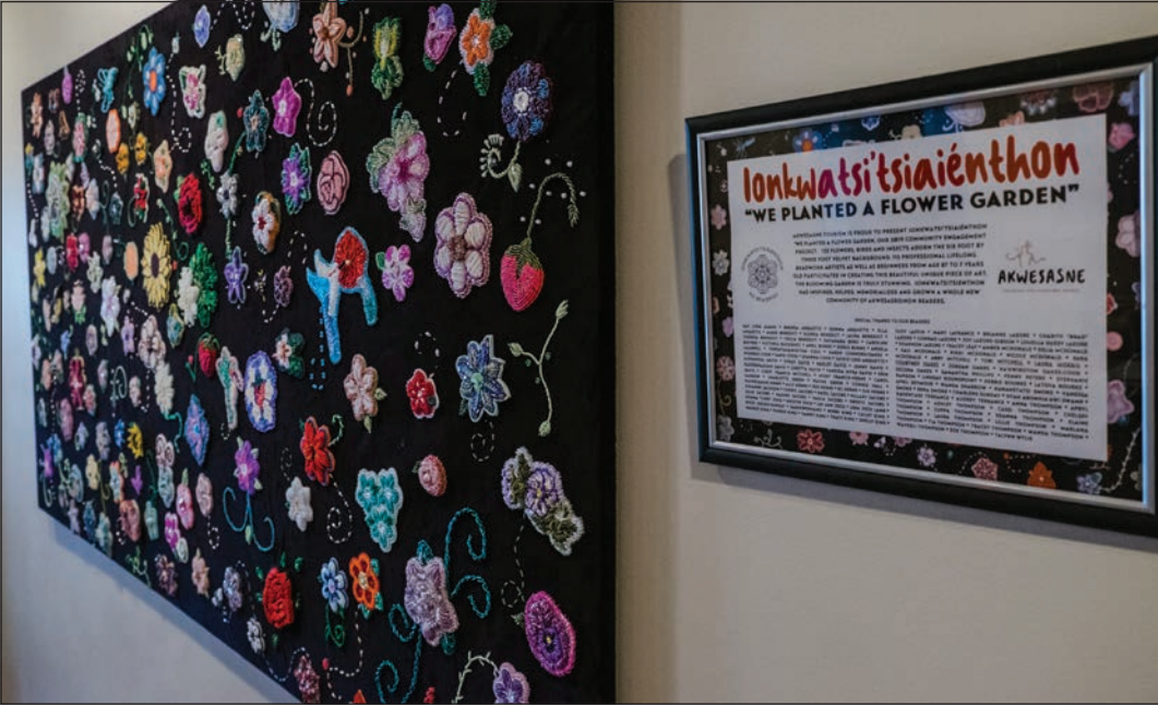
The new initiative from the Saint Regis Mohawk Tribe's Cultural Tourism, "We Planted a Flower."