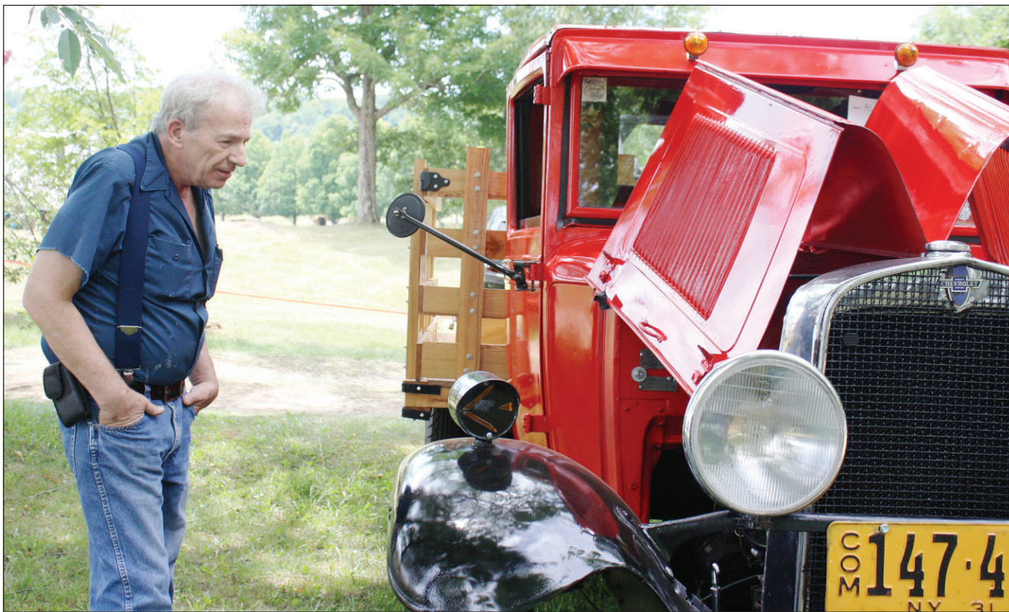
The Malone Auto Club's annual car show

The T38 Jet is located in front of Post 939's family park, as part of a display honoring past veterans. The former training jet is visible from the road along U.S. Route 11.