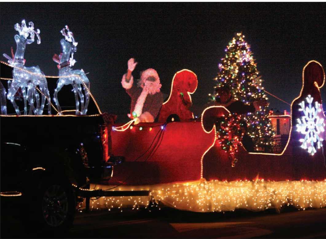
One of the floats from the annual Akwesasne Parade of Lights.

AKWESASNE – The Saint Regis Mohawk Tribe's Cultural Tourism initiative unveils new community engagement project, Ionkwatsi'tsiaiénthon, "We Planted a Flower Garden". Comprised of only beadwork, this amazing piece is an artistic expression that represents the living Mohawk culture. Over 100 artists from Akwesasne participated in the project's creation; which was designed to promote and engage community, culture and art. Ionkwatsi'tsiaiénthon is on display at the Akwesasne Cultural Center & Museum.