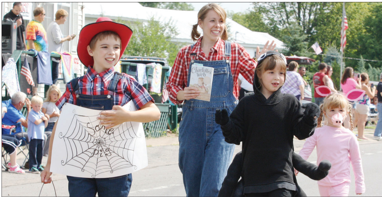
A scene from the Moira Heritage Day parade