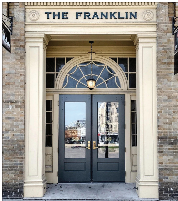
A Pokemon and trading card shop is planned for the Franklin Building on Watertown's Public Square. Watertown Daily Times

The owners will be working at the shop with plans to grow the number of employ-