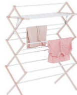
Wooden Clothes Racks

Dry Goods, Spices, Gifts, Shoes, Boots, Vitamins, Essential Oils, Housewares, Wood and Coal Stoves, Coal and Much More!