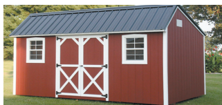
Rent-to-Own Storage Sheds