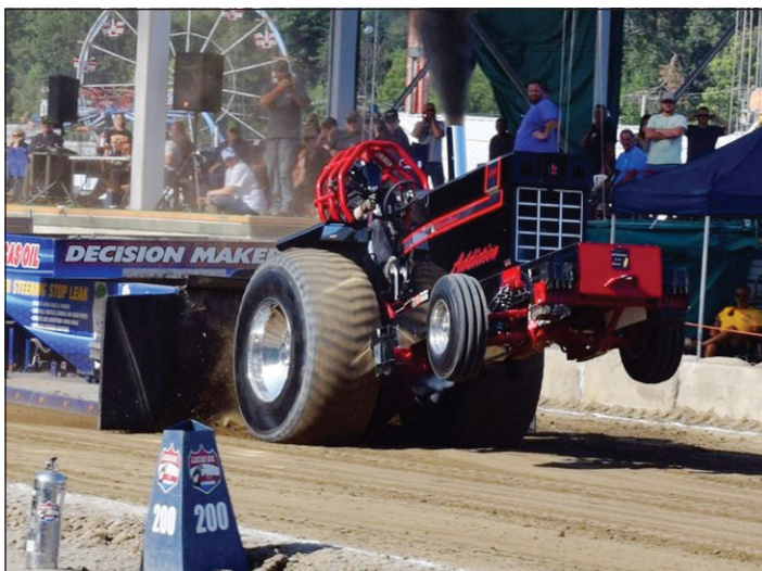
The tractor pull at the fair.