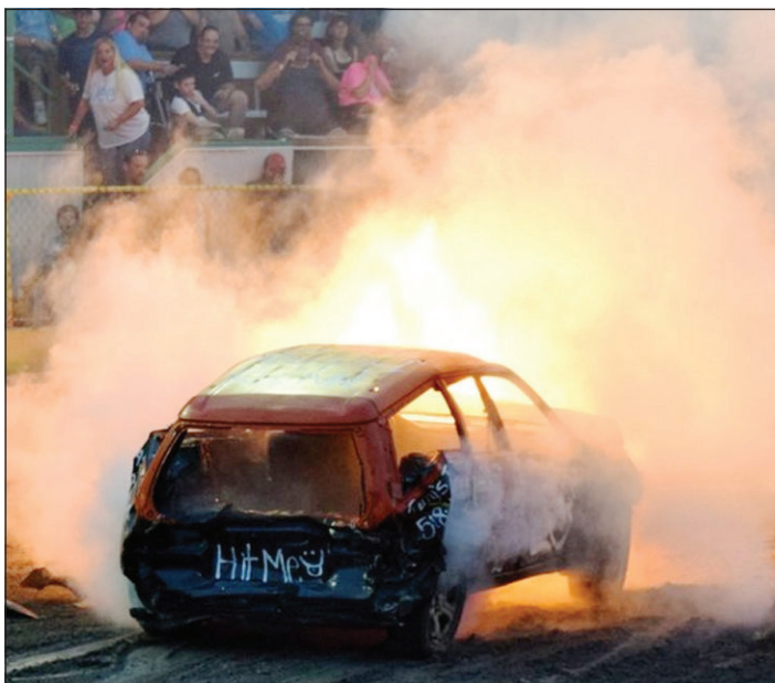
The demolition derby is a "hot" ticket at the fair.