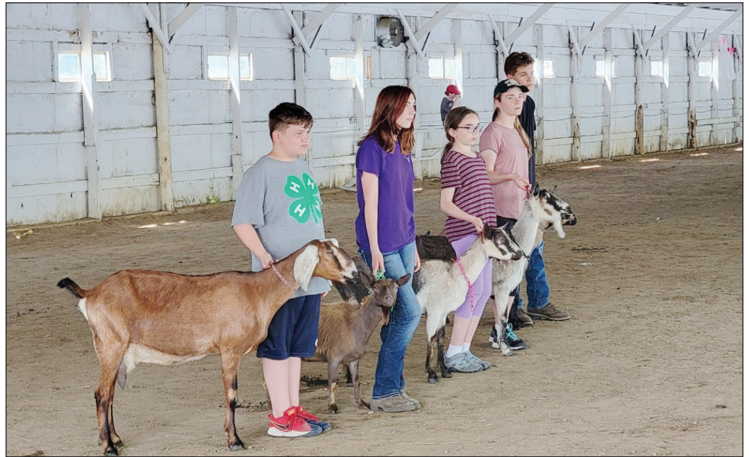
4-H Youth start practice for The Fair and Goat Showmanship at Small Ruminant Camp.

Visit the 4-H Youth Building at the Franklin County Fair with your children. Sensory Tables with kinetic sand, building bricks and a new Tower Building Pit this year will give parents a nice break while they can relax and watch from the benches. Enjoy a delicious Walking Taco, the meal in a bag, made from all local Tucker's Black Angus beef with sour cream and cheese from Cabot. Milkshakes are delicious and made from Stewart's Ice Cream and local milk! Popcorn with real Cabot butter! Watch daily interactive presentations on everything from butter making, goat yoga, to cold felting raw wool on our 4-H stage. Come meet 4-H! Visit our website at http://franklin.cce.cornell.edu/ for updates on shows and activities!