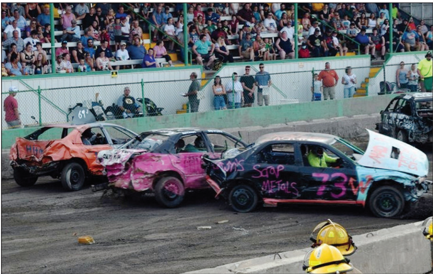
The demolition derby is always a popular attraction at the Franklin County Fair.

On August 7, the daytime schedule will feature Holstein and red and white cattle, horses and a poultry judging. There will be a demolition derby at 4:30 p.m. and grandstand admission costs $8 with children 8 years old and younger admitted free.