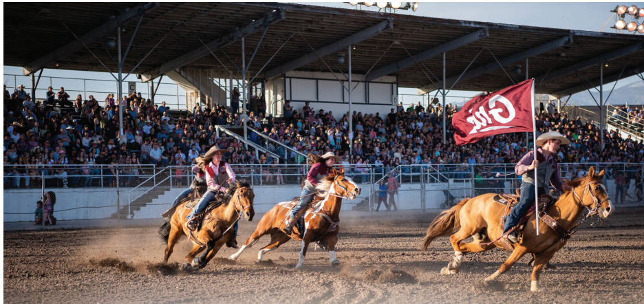
The UM rodeo team speeds into the arena on opening night of the final college rodeo at Missoula Fairgrounds in 2023.