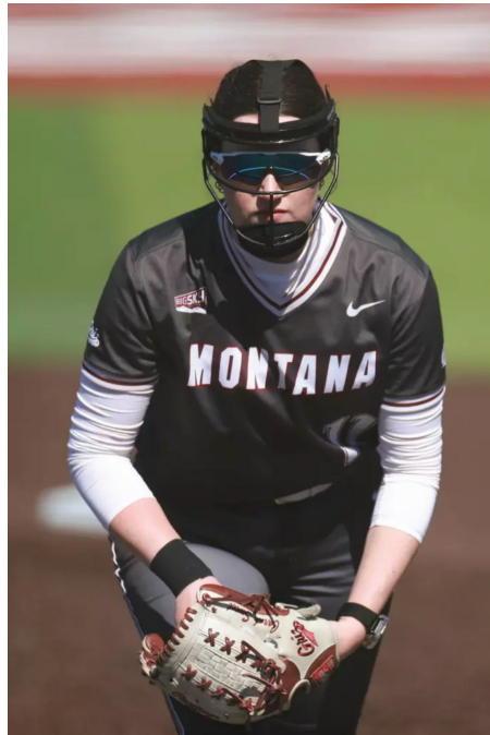
Montana plays against Northern Colorado at the Grizzly Softball Field in Missoula on April 4.