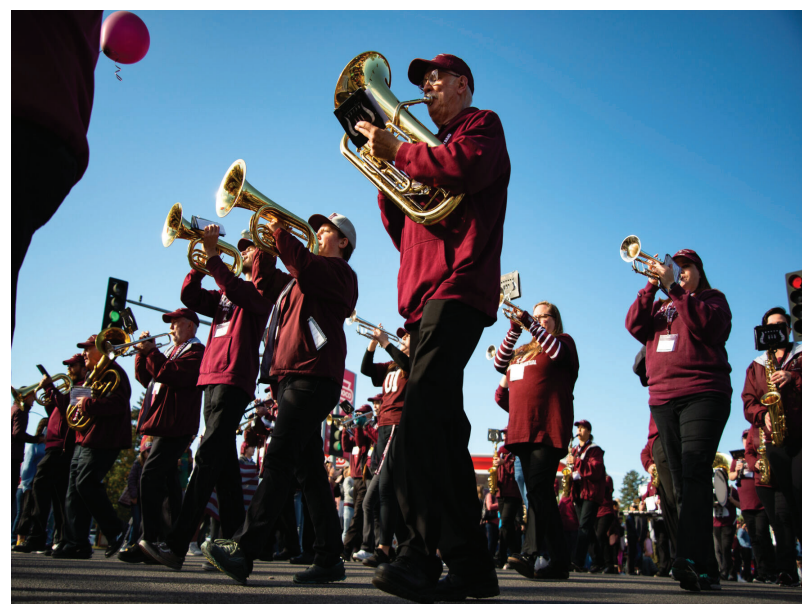
RIGHT: Members of the alumni marching band play during the UM Homecoming parade down South Avenue.