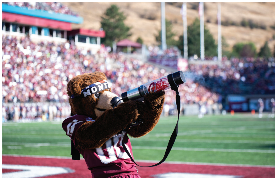
ABOVE: Monte shoots t-shirts out of a cannon into the crowd during the game against Portland State on Sept. 24. Monte was joined by UM's previous bear mascot, now playing clutch for the Huston Rockets, in honor of the homecoming game.