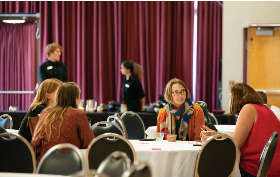
Students sit in groups during the ice cream social hour after the leadership summit in the University Center Ballroom on Sept. 17.