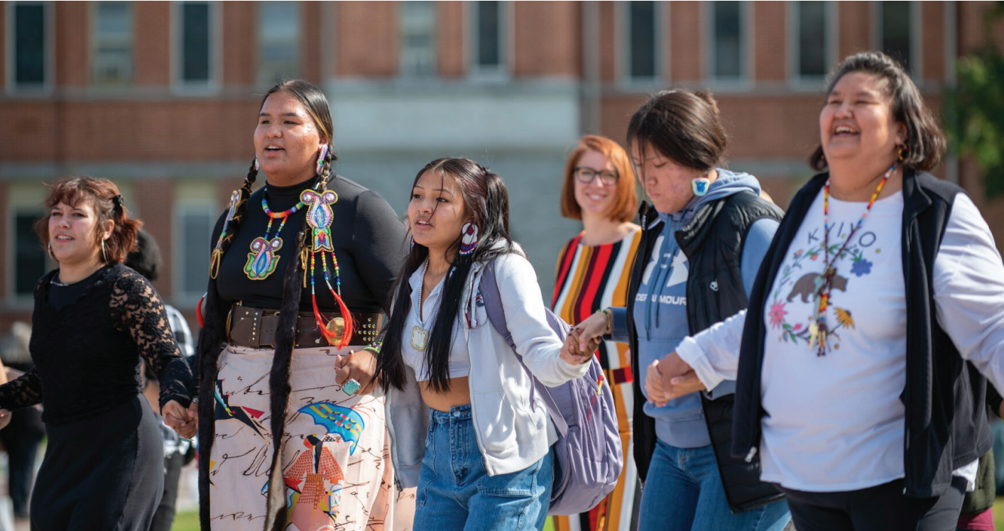
At the round dance on the Oval on Sept. 23, the circle swelled, leading to the formation of a second circle to form as more participants began to join in on the celebration.