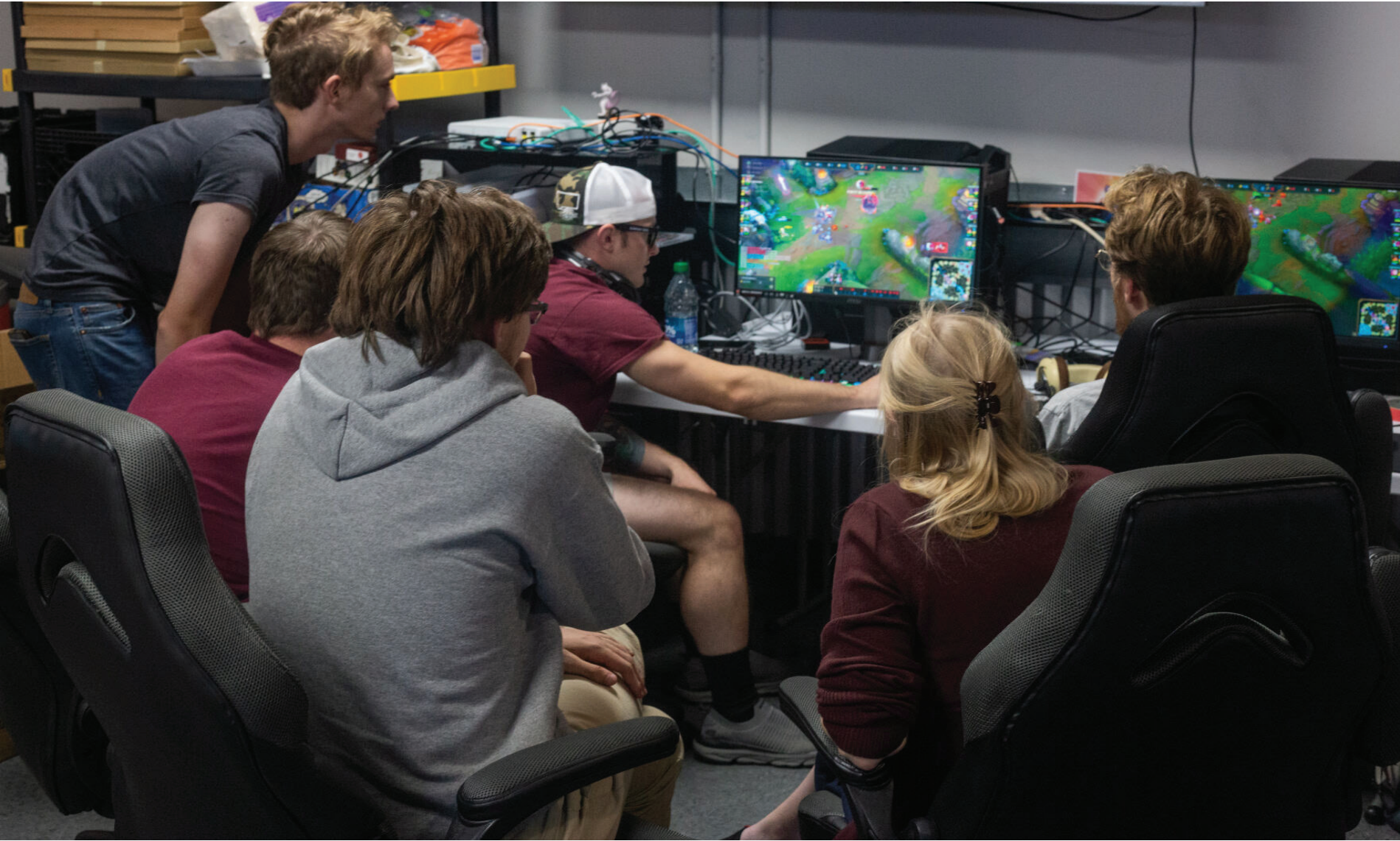
The Griz esports League team gathers around a computer as they review the match they finished on Sept. 7. The team reflects on character builds — equipment earned during the match — and team strategy to improve for the upcoming season.