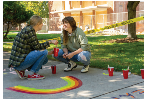
FAR LEFT: A bonfire crackles at the 2022 Yell Night pep rally on Sept. 23.