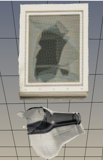
COLTON ROTHWELL | MONTANA KAIMIN

Stickers displaying false, bigoted slogans were recently spotted on campus. Subsequently, even more offensive stickers, bearing false statistics on people of color and the LGBTQ+ community, appeared at UM bus stops and were removed by UMPD officers. UM’s legal council is working with the FBI to further investigate this latest round of sticker harassment. The Kaimin will follow up on this story.