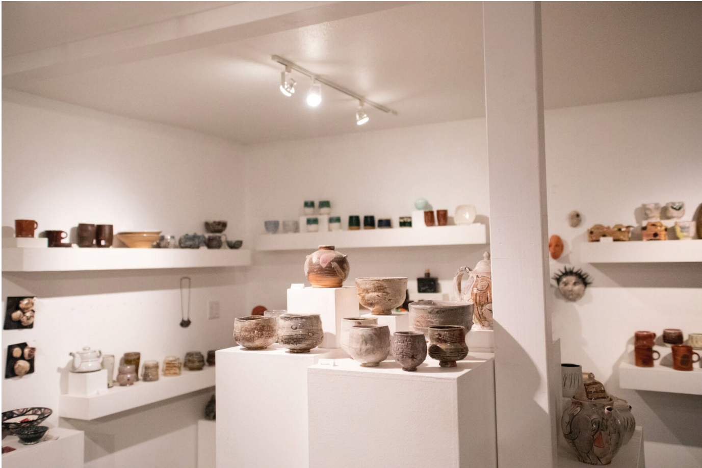
Ceramic pieces made by University of Montana post-baccalaureate students line the shelves at the Clay Studio of Missoula during their show on Nov. 6, 2020. Several students displayed a range of work from mugs, bowls and flasks to larger sculptures mounted on the walls.

The pandemic has not necessarily taken a toll on the art per se, but rather the artist,