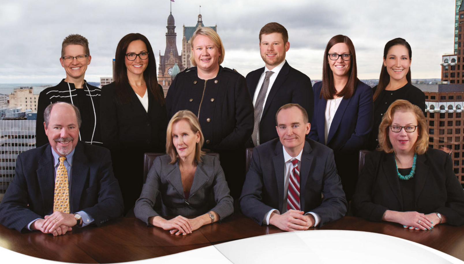
Chart a Course for Lasting Legacy

At Reinhart, we help high-net-worth clients build and preserve wealth, whether they are actively engaged in business or enjoying the rewards it has produced.