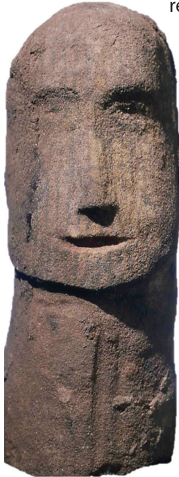
Artist once known, 1050-1200 CE

With the arrival of French explorer Étienne Brûlé nearly 400 years ago, followed by Jean Nicolet, Louis Joliet, and Father Jacques Marquette, came an artistic beachhead established by mapmakers and sketch artists.