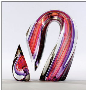
Harvey Littleton, 1986