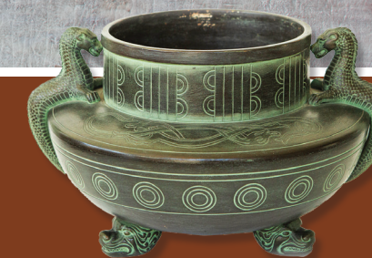
Norse Pottery, 1903-1913

From the caves of prehistory in Wisconsin's only land untouched by the glaciers, the authors follow a trail of creative endeavor at its most local level, through the periods of French-Canadian exploration, British occupation, American territorial settlement and statehood, through the twentieth century.