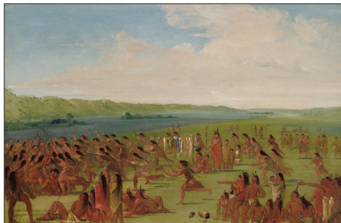
George Catlin, 1835-1836