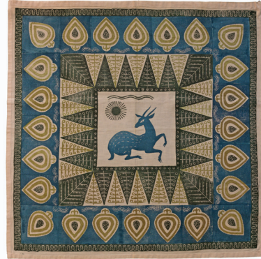
Milwaukee Handicraft Project, 1935-1943