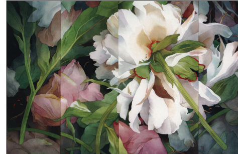
Jean Crane, 2005

A Creative Place traces the artistic impact of the second and perhaps most significant wave of German immigration to the state beginning in the final quarter of the nineteenth century.