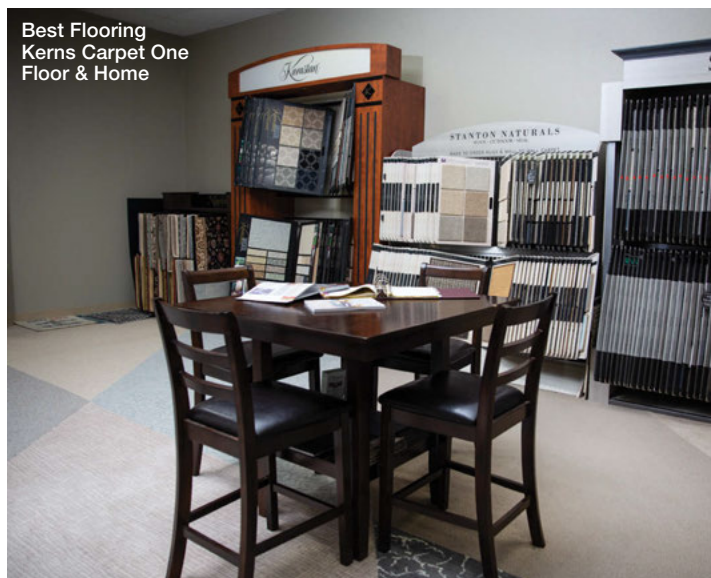
Best Flooring Kerns Carpet One Floor & Home

McNabb & Risley Fine Furniture and Interior Design Deep River Partners