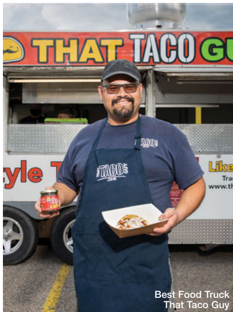
Best Food Truck That Taco Guy