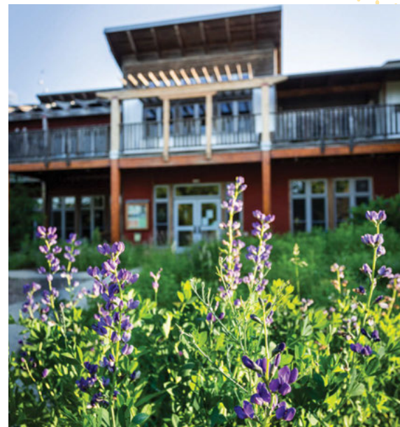
Best Pet Boarding Central Bark Doggy Day Care