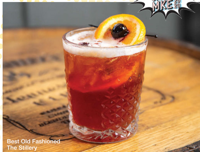
Best Old Fashioned The Stillery