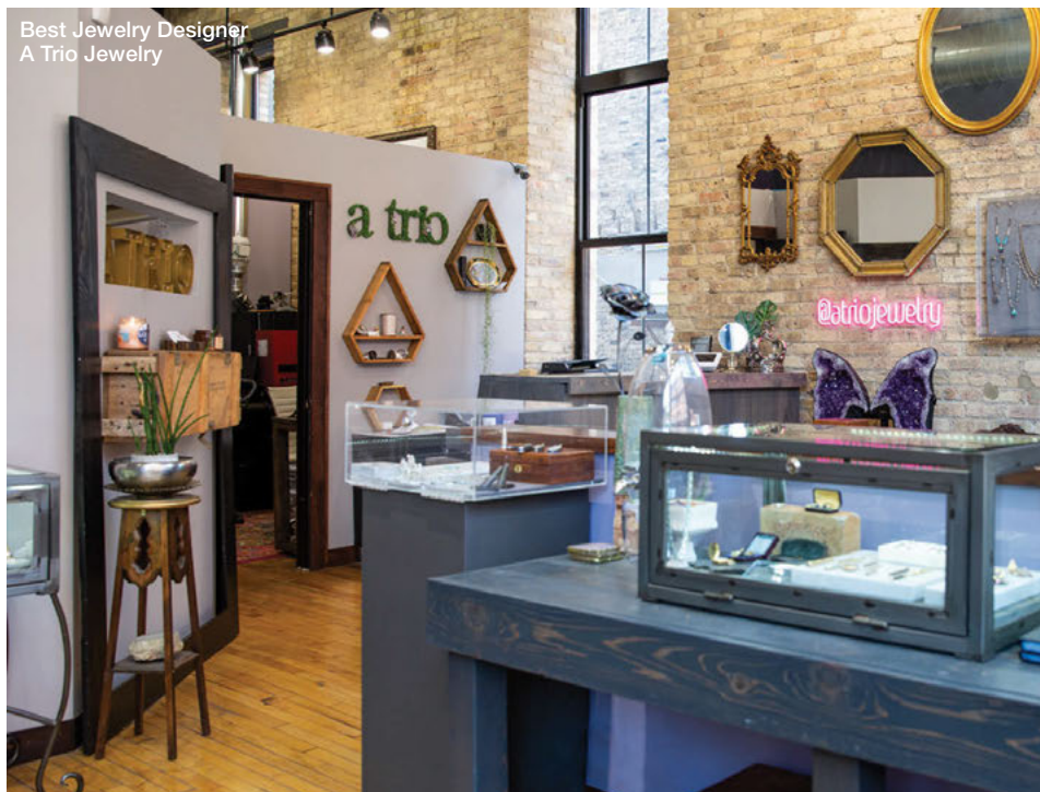
Best Jewelry Designer A Trio Jewelry