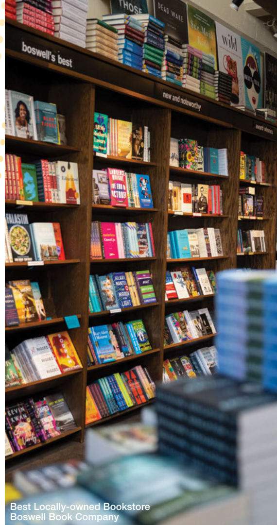
Best Locally-owned Bookstore Boswell Book Company