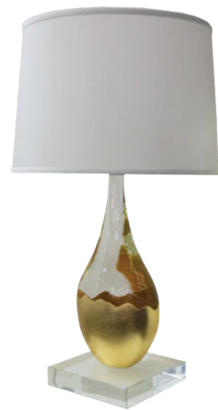
Best Lighting BBC Lighting