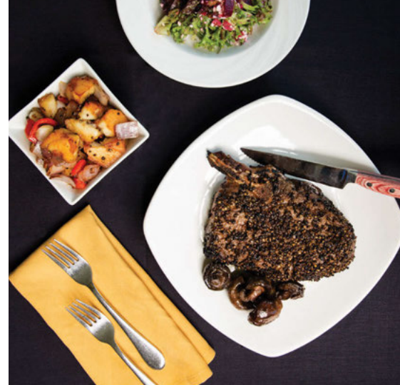
Best Lake Country Dining Palmer's Steakhouse

college kid, this quintessential Brew City tavern features more than a dozen hi-def screens (including a massive 10-footer), plus game-time specials, free popcorn, shuffleboard, a pressure-free trivia night and shuttles to sports and entertainment events throughout the city.