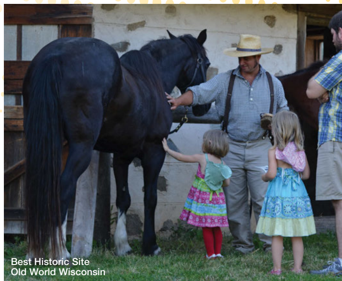
Best Historic Site Old World Wisconsin