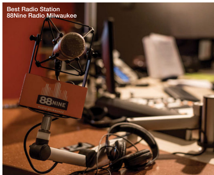
Best Radio Station 88Nine Radio Milwaukee