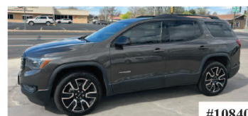
#10840 2019 GMC ACADIA Gray, Leather, FWD, 3.6L, 125K Miles. $15,495.