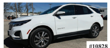
#10828 2022 CHEVROLET EQUINOX White, Leather, 4WD, 1.5L, 83K Miles. $21,995.