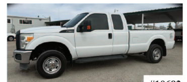
#10692 2016 FORD F-250 White, Cloth, 4x4, 6.2L, Ext LB, 106K Miles. $20,995.