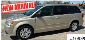
NEW ARRIVAL #10839 2015 DODGE GRAND CARAVAN Gold, Cloth, 3.6L, 95K Miles. $9,995.