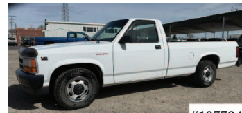
#10779A 1996 DODGE DAKOTA White, RWD, 5 Speed Manual, Cloth, 3.9L, 103K Miles. $5,495.