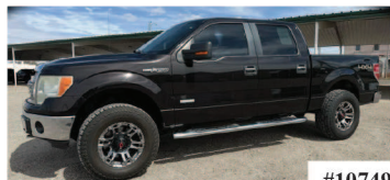
#10749 2013 FORD F-150 Brown, 4x4, Cloth, Crew Cab, 3.5L, 143K Miles. $14,995.