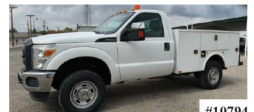
#10794 2014 FORD F-350 UTILITY White, Cloth, 4x4, 6.2L, New tires, 22K Miles. $24,995.