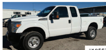
#10553 2016 FORD F-350 White, Vinyl, 4x4, 6.2L, Ext SB, 59K Miles. $26,495.