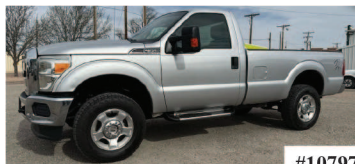
#10797 2012 FORD F-350 Silver, Cloth, 4x4, 6.2L, Single Rear Wheel, 96K Miles. $22,495.