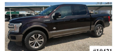
#10421 2019 FORD F150 KING RANCH Brown, Leather, 4x4, 3.5L, 92K Miles. $32,495.