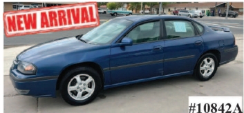
NEW ARRIVAL #10842A 2003 CHEVROLET IMPALA Blue, Cloth, 3.8L, 131K Miles. $5,995.

Financing for all Credit. Buy Here Pay Here financing also available.