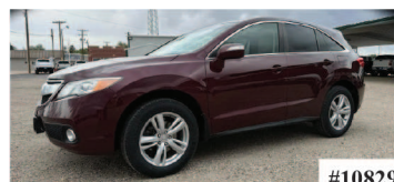
#10829 2014 ACURA RDX Maroon, AWD, Leather, New tires, 3.5L, 82K Miles. $14,995.