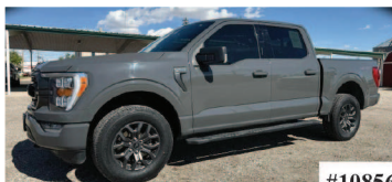
#10856 2021 FORD F-150 Gray, 4x4, Cloth, 2.7L EcoBoost, New Tires, 76K Miles. $34,495.