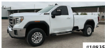
#10835 2022 GMC 2500HD SLE White, Cloth, 4x4, 6.6L GAS, 22K Miles. $43,995.