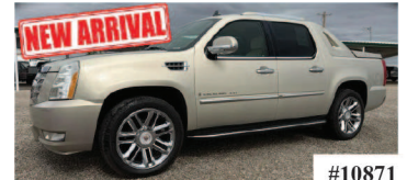
NEW ARRIVAL #10871 2007 CADILLAC ESCALADE Gold, AWD, Leather, Like New, 6.2L, 89K Miles. $19,995.