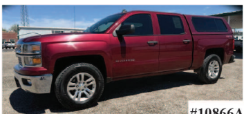
#10866A 2014 CHEVY SILVERADO 1500 Maroon, 4x4, Crew Cab, Cloth, 5.3L, 134K Miles. $18,995.