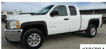
#10690A 2013 CHEVY 2500HD White, 4x4, Vinyl, Ext SB, 6.0L, 136K Miles. $18,995.