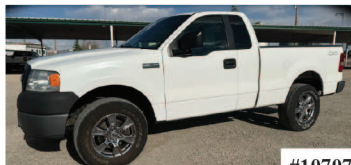
#10707 2008 FORD F-150 White, Cloth, 4x4, 4.6L, New Transmission, 58K Miles. $12,995.