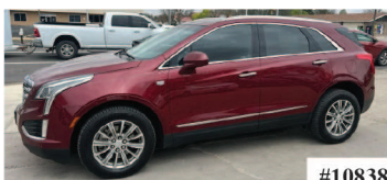
#10838 2018 CADILLAC XT5 Maroon, FWD, Leather, 3.6L, 104K Miles. $16,995.