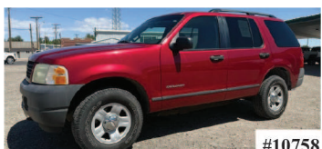
#10758 2004 FORD EXPLORER Red, Cloth, 4WD, 4.0L, 90K Miles. $9,495.