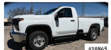
#10865 2023 CHEVY 2500HD White, 4x4, Cloth, 6.6L GAS, 12K Miles. $39,995.