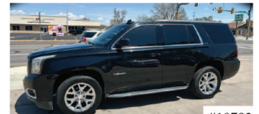
#10792 2017 YUKON Black, 4x4, Cloth, 5.3L, Center Bench, 95K Miles. $24,995.