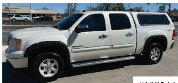
#10824A 2010 GMC SIERRA 1500 Pearl, Leather, 4x4, 5.3L, 179K Miles. $11,495.