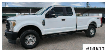
#10812 2018 FORD F-250 White, 4x4, Ext Cab LB, 6.2L, 89K Miles. $25,995.