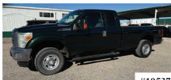
#10537 2013 FORD F-250 Green, Cloth, 4x4, Ext Cab LB, 6.2L, 129K Miles. $16,995.