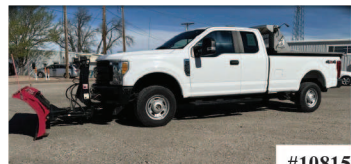
#10815 2017 FORD F-250 White, Cloth, 4x4, 6.2L, Boss Snow Plow, Dump Bed, 41K Miles. $32,495.