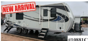
NEW ARRIVAL #10881C 2021 NORTHWOOD ARCTIC FOX Grey, Single Slide, Like New, 4 Season. $23,995.