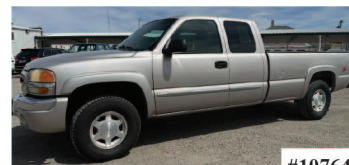
#10764 2004 GMC 1500 Pewter, 4x4, Cloth, Ext Cab LB, 5.3L, 174K Miles. $9,495.