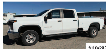
#10683 2023 CHEVY 2500HD White, Cloth, 4x4, Crew Cab LB, 6.6L GAS, 51K Miles. $36,995.