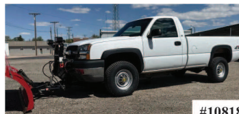
#10818 2004 CHEVY 2500HD White, Vinyl, 4x4, 6.0L, Boss Snow Plow, 86K Miles. $19,995.