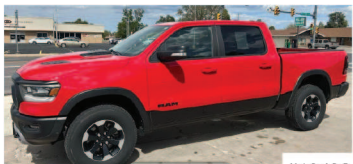
#10498 2019 RAM REBEL 1500 Red, 4x4, Leather, 5.7L Hemi, 118K Miles. $28,495.