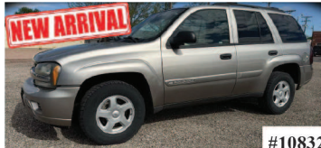
NEW ARRIVAL #10832 2002 CHEVROLET TRAILBLAZER Gold, 4x4, Cloth, 4.2L, 128K Miles. $7,995.