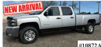
NEW ARRIVAL #10872A 2010 CHEVY SILVERADO 35000 Silver, Cloth, 4x4, Crew LB, 6.0L, 110K Miles. $23,995.