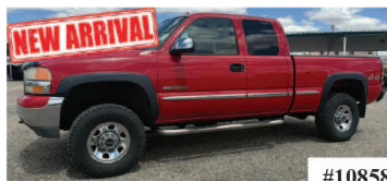
NEW ARRIVAL #10858 2002 GMC SIERRA 2500 Red, 4x4, Leather, Ext SB, 6.0L, B&W Turnover Ball, 131K Miles. $14,995.