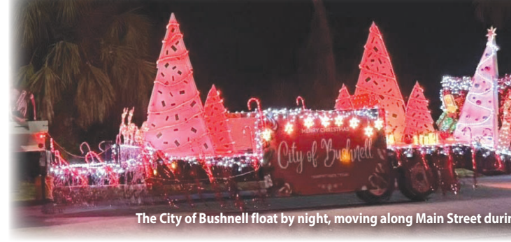
The City of Bushnell float by night, moving along Main Street during the parade.