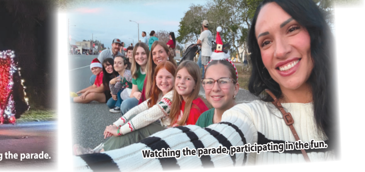
Watching the parade, participating in the fun.