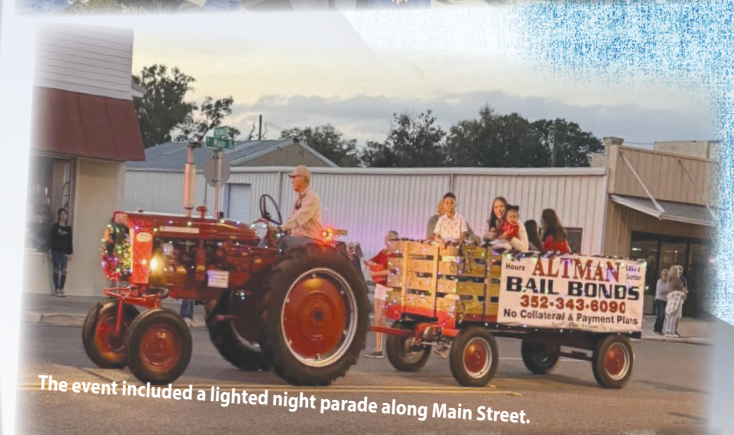
The event included a lighted night parade along Main Street.