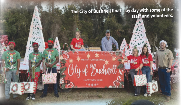
The City of Bushnell float - by day with some of the staff and volunteers.