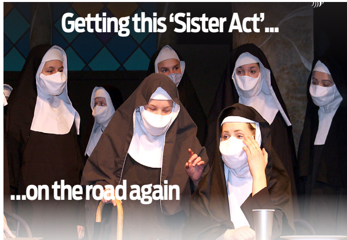
Getting this 'Sister Act'...