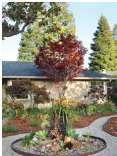
Los Altos homeowner Susan Moss removed her front lawn and relandscaped with native plants that are adored by birds like dark-eyed juncos.

There are several benefits to planting natives in the garden. Plants native to California tend to be both drought-tolerant and fire-resistant,