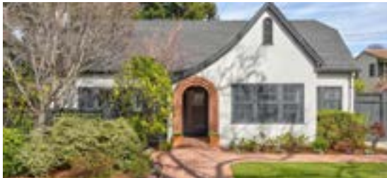
Charming 4-bed + office, 2-bath beauty with ADU Offered at $4,200,000 | Sold for $4,730,000