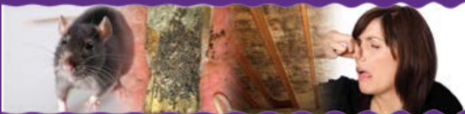
RODENTS AND THEIR WASTE