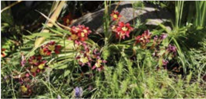
California native plants naturally tend to be both drought and fire-resistant — in addition to being gorgeous additions to your garden.