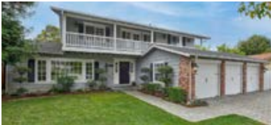
Beautifully remodeled 4-bed, 3-bath Monterey Colonial Offered at $3,495,000 | Sold for $3,975,000