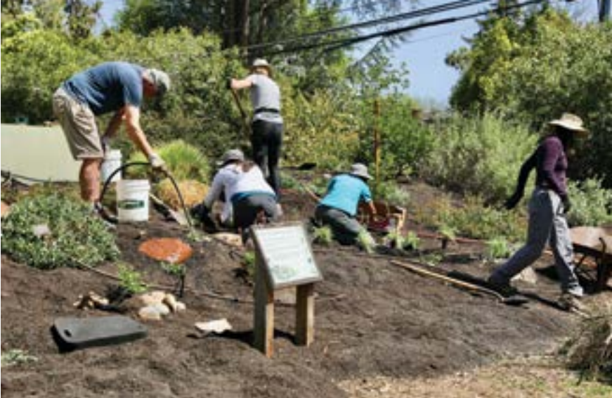
GreenTown volunteers, at left and above, work to ready the newly revitalized Woodland Branch Library garden for its unveiling at the end of the Lawn-Be-Gone Bike Ride April 9.

Of course, grass lawns hold social value, as many families use their yards to play sports and host gatherings. Grass also serves a vital role in keeping urban temperatures down. GreenTown recommends relandscaping with native plants rather than other popular alternatives like a rock garden, because rock gardens can trap heat and drive temperatures higher. However, the goal of the effort is not to get everyone to totally replace