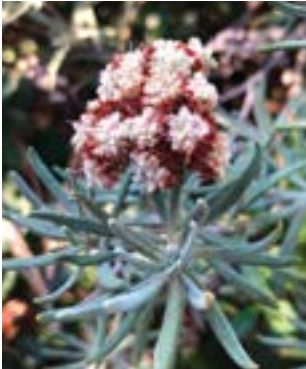
Santa Cruz Island buckwheat blooms in the summer, then the flowers fade from cream to rust in the fall and remain neat-looking for a long time. Native buckwheats are “habitat heroes” that can fit into any garden.

Serving Santa Clara & San Mateo Counties Here for our local community, no matter what, since 1981