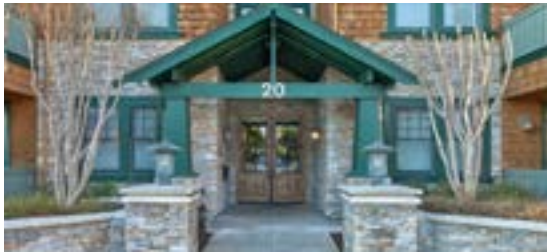
Bright 2-bed, 2-bath townhome in a stunning complex Offered at $1,000,000 | Sold for $1,122,000