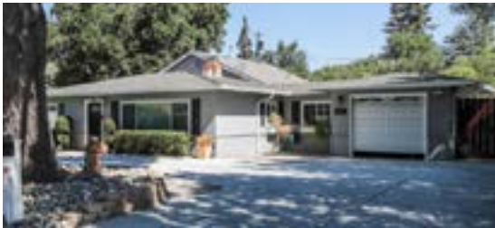
Remodeled 4-bedroom, 2.5-bath home in prime Saratoga Offered at $2,400,000 | Sold for $2,295,000