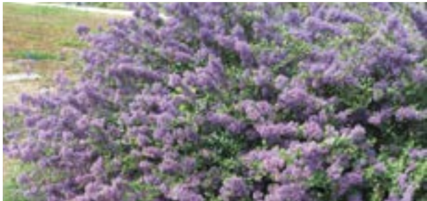
Valley Violet ceanothus is one of the tough, reliable, drought-tolerant Arboretum All-Stars that does well in gardens. These “habitat heroes” bloom in spring. Mounding 3-4 feet high and wide, this shrub is a manageable size for small gardens.