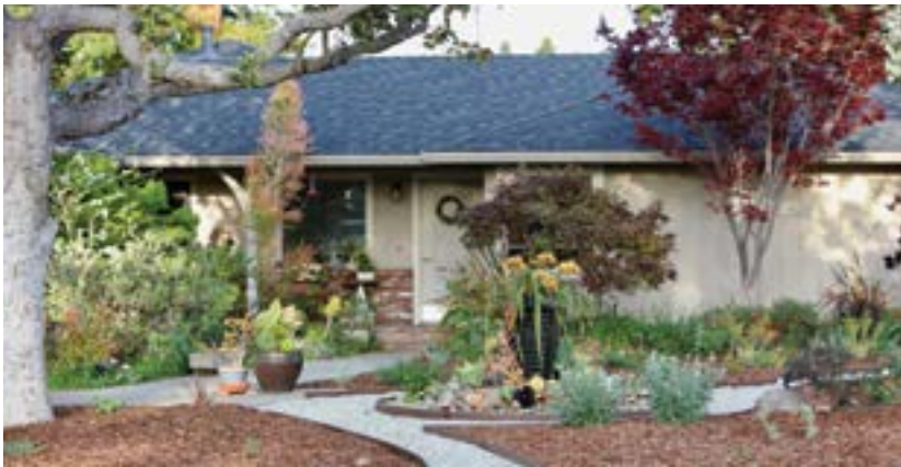
Susan Moss' Los Altos home was used as a picturesque stop on the GreenTown Lawn-Be-Gone Bike Ride.

the original irrigation system. The garden was due for an enhancement, and Chang saw it as a learning opportunity.