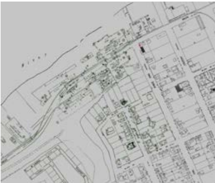
Sanborn Map of Hawk Hill

Many Chattanoogaans remember the site as the home to the Kirkman Technical School operated from 1928-1991. The school's mascot was the Golden Hawks, and the hill was often referred to as "Hawk Hill" or "Kirkman Hill." The high school was located at the base of the hill, along Chestnut Street, where the IMAX Theatre, Creative Discovery Museum, Marriott Residence Inn, and Hilton Garden are located. In 1991, the school closed with the City of Chattanooga retaining ownership until 1994 when River City Company purchased the site from the City of Chattanooga for $2,500,000 for the purpose of facilitating redevelopment.