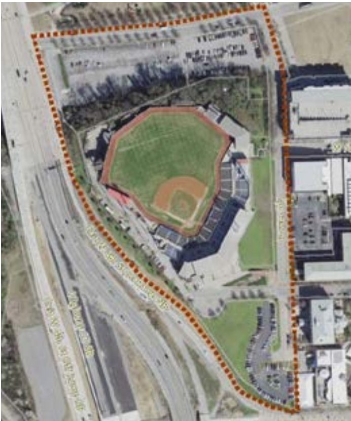
Outlined planning area of Hawk Hill