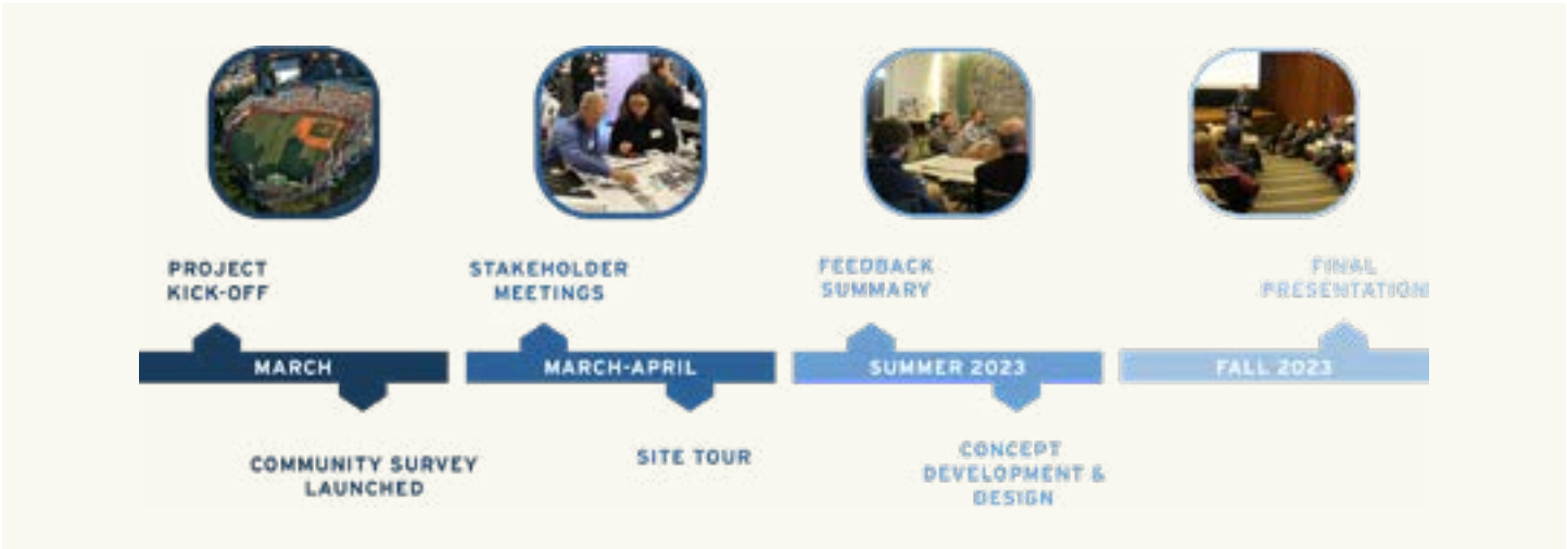
Timeline for planning process

When considering Hawk Hill, the nearby parking lots provide an opportunity to look holistically at the site. The planning process will take into consideration the needs of large-scale events that are hosted in the Riverfront District and utilize the parking lots.