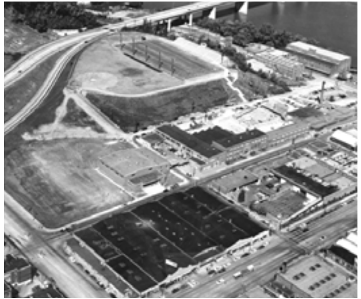
Kirkman Technical School, 1928-1991

Per the sales agreement, River City Company then gifted a portion of the land (the former gymnasium site) to the Creative Discovery Museum for the construction of a children's museum. The remainder of the land was to be redeveloped for businesses or activities that were compatible with the Tennessee Aquarium and Ross's Landing Park & plaza, the children's museum, and other public and private property in the vicinity.