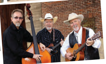
Slade Rivers Band

3:30 pm Frontier Town Bud Light Stage 4:00 pm Frontier Town 49er Kids' Town 4:30 pm Biagi Bandstand 6:30 pm Bud Light Stage 7:00 pm Biagi Bandstand 8:00 pm Benny Brown Arena