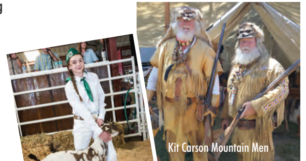
Kit Carson Mountain Men