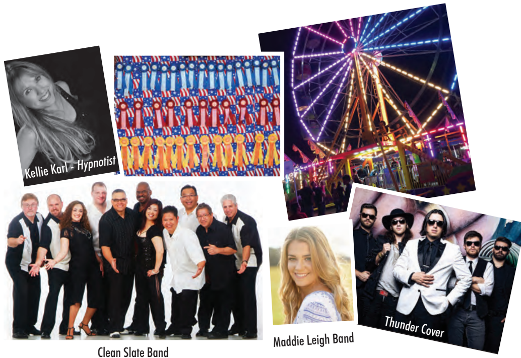
Clean Slate Band