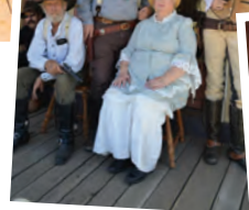
Wild West Law Dawgs & Outlaws and Ladies