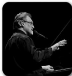
MIKE REID Grammy Winning Artist & Penn State Football Letterman