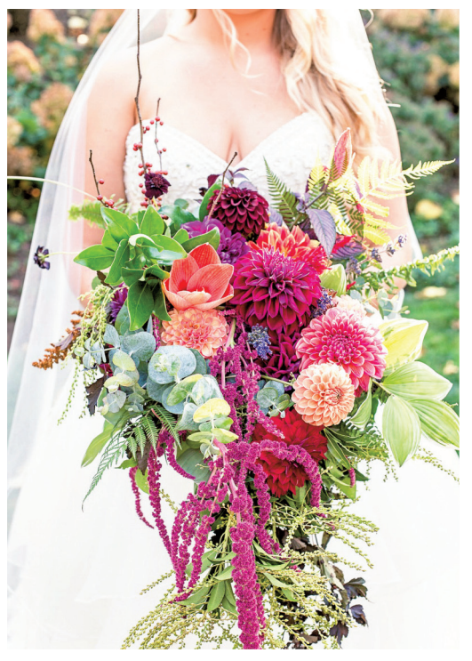
FLOWERS BY SPLINTS AND DAISIES

T hrowing the bridal bouquet over one's shoulder at wedding's end could be a problem these days. Huge, wildly imaginative bouquets are the newest fashion, and they're often so heavy — 30 pounds or more — that throwing them might knock somebody out.