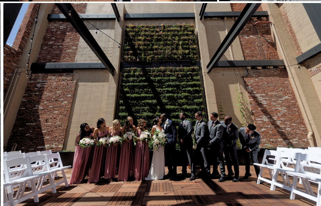
CAKE: Rosie's Creative Cakes, Manheim // FLOWERS: Splints and Daisies, Lancaster HAIR: Bristle and Prim, Lancaster // MAKEUP: MKUP The Beauty Studio, York