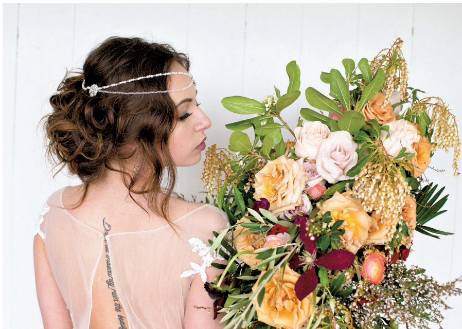
FLOWERS BY SPLINTS AND DAISIES

That's an easy one, say florists. They simply create a second, lighter bouquet that's perfect for throwing — and catching.