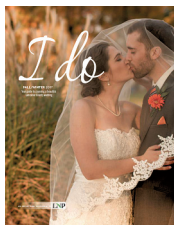
Creative Interpretations Photography

A special thanks to our other four finalists. ▼