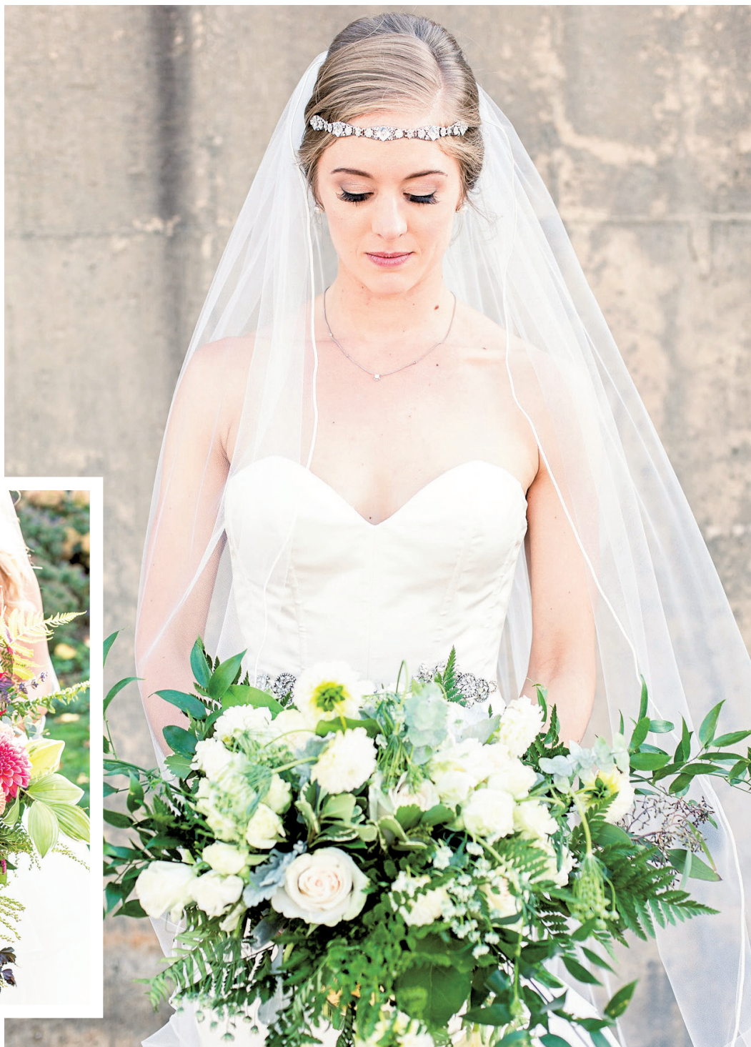
FLOWERS BY WEDDING FLOWERS BY CYNDI