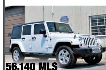
2012 Jeep Wrangler Unlimited Sahara