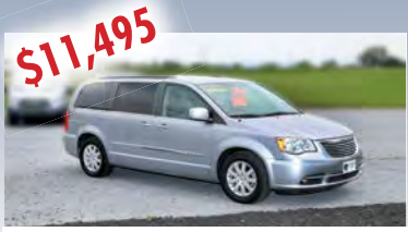
2014 CHRYSLER TOWN & COUNTRY