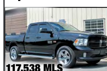
2014 Ram 1500 Express