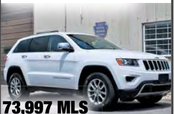
2014 Jeep Grand Cherokee Limited