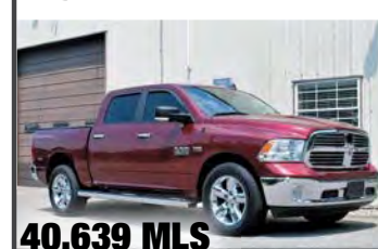
2017 Ram 1500 Big Horn