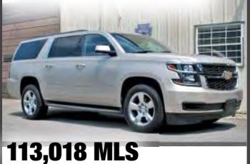
2015 Chevrolet Suburban 1500 LT