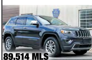
2015 Jeep Grand Cherokee Limited