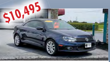
2012 VW EOS