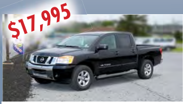
2013 NISSAN TITAN