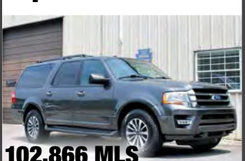
2017 Ford Expedition EL XLT