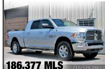
2017 Ram 2500 Mega Cab Big Horn