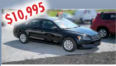
2012 VOLKSWAGEN PASSAT