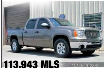
2012 GMC Sierra 1500 SLE