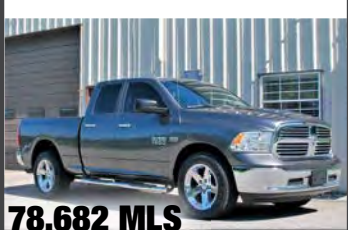
2016 Ram 1500 SLT