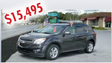
2015 CHEVY EQUINOX