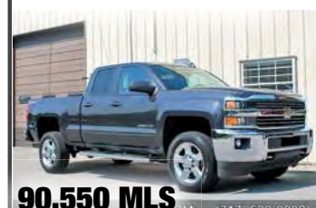
2016 Chevrolet Silverado 2500 HD