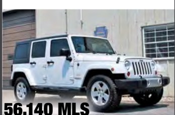
2012 Jeep Wrangler Unlimited Sahara