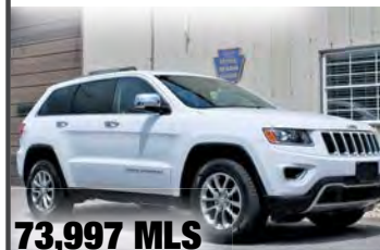
2014 Jeep Grand Cherokee Limited