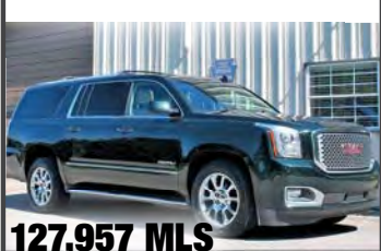
2016 GMC Yukon XL Denali

LET US HELP YOU GET TO WHERE YOU'RE GOING!