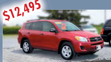
2010 TOYOTA RAV 4