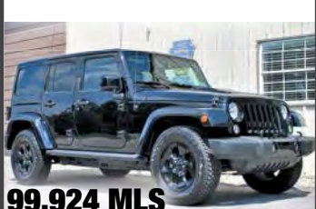
2015 Jeep Wrangler Unlimited Altitude