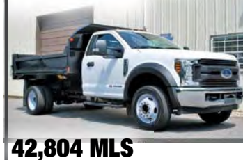
2019 Ford F-450 Dump Body