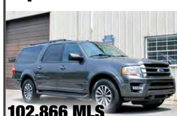
2017 Ford Expedition EL XLT