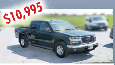
2005 GMC CANYON