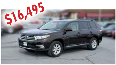
2011 TOYOTA HIGHLANDER