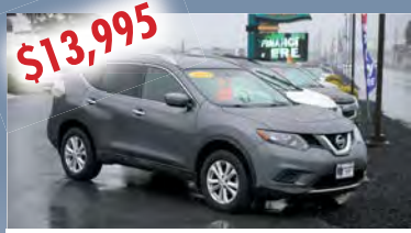
2014 NISSAN ROGUE