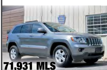
2012 Jeep Grand Cherokee Laredo