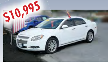
2012 CHEVY MALIBU