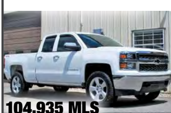
2015 Chevrolet Silverado 1500 LS