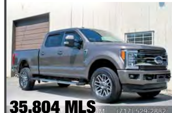
2018 Ford F250 Lariat