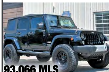
2014 Jeep Wrangler Unlimited Sahara