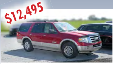
2008 FORD EXPEDITION