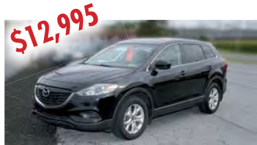
2013 MAZDA CX-9