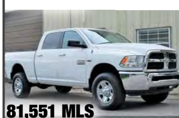
2014 Ram 2500 SLT