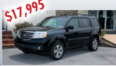
2013 HONDA PILOT