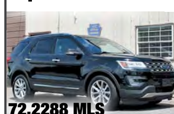
2017 Ford Explorer Limited