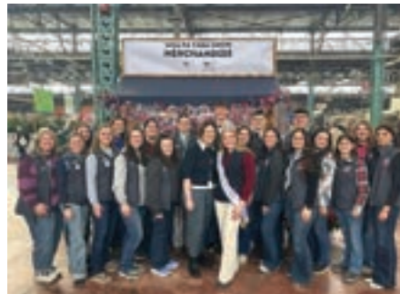
PA Farm Show Junior Committee