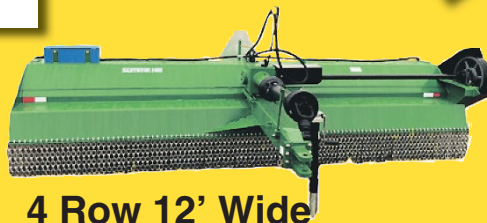
4 Row 12' Wide • Standard Size Shredders Available up to 13' Wide

• Shredder Manufacturing, Sales & Rentals.