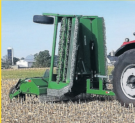
8 Row pictured

105 Rohrer Mill Rd., Ronks, PA 17572 717-687-0186