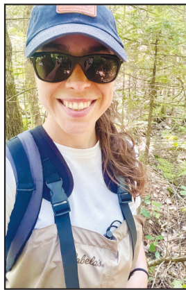
By BREE ROSSITER Lake Winnepesaukee Alliance

The new sticker makes it easier for the state to track compliance with how funds