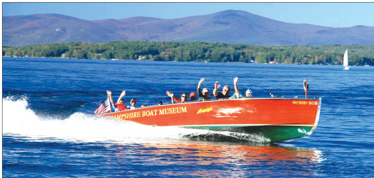
A 28-foot, mahogany, triple cockpit “woodie” and replica 1928 Hacker-Craft that is accurate down to the seat colors, the New Hampshire Boat Museum’s Millie B recreates the experience of the golden age of boating.

reveal details regarding upcoming special exhibits and featured art created by local artists.