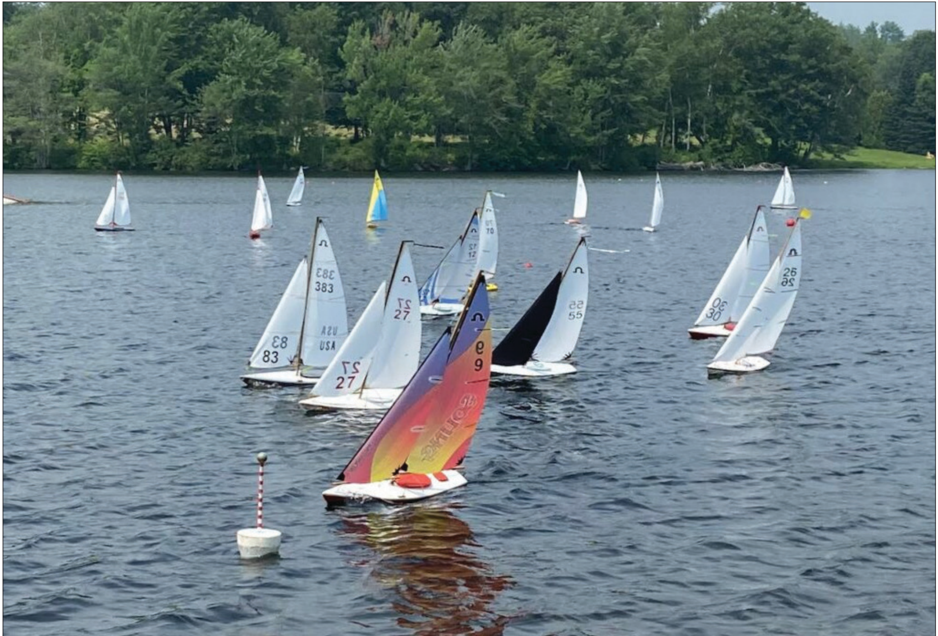
Back Bay Skippers Model Yacht Club will host the annual Sasquatch Footy Regatta on Saturday, June 18 at Back Bay.