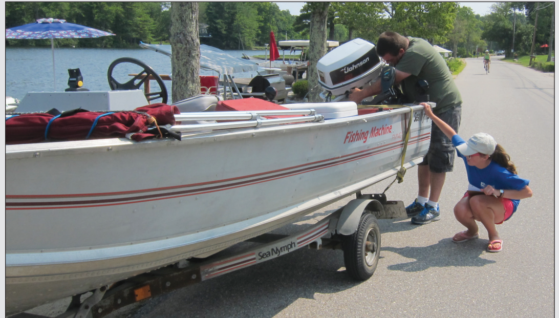
Lake Hosts and boaters work together to prevent the spread of invasive species from waterbody to waterbody.