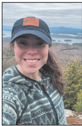
By BREE ROSSITER Lake Winnepesaukee Association

Have you ever jumped off a dock and felt an unexpected chill as the water quickly got colder the deeper you went, only to feel warmer again when you resurfaced? That's an example of thermal stratification — a process where a lake divides into layers based on water temperature. As water warms up, it becomes less dense, creating these distinct layers that shift with the seasons. With fall approaching, we're nearing what's known as lake turnover.