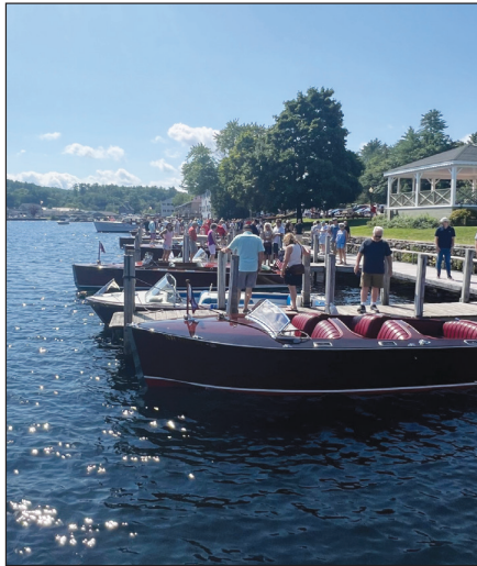
Attendees mill about at the Alton Bay Boat Show in August.

"We celebrate boating, the outdoors, lake life, and both historic and modern boating culture, which is