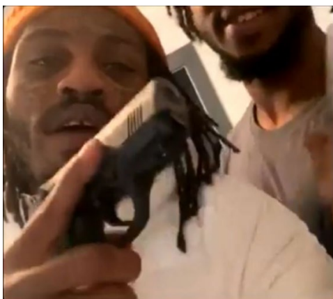
Photo from Defendant's Facebook on December 25, 2020