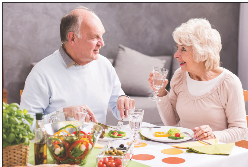
METRO CREATIVE CONNECTION

The challenges are all around, beginning with poor eating habits developed in younger days when our