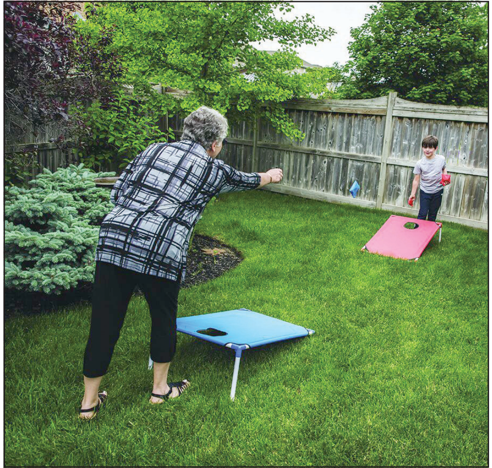
METRO CREATIVE CONNECTION

Backyard events can be enhanced with some game play. There are plenty of fun options for your next gathering.