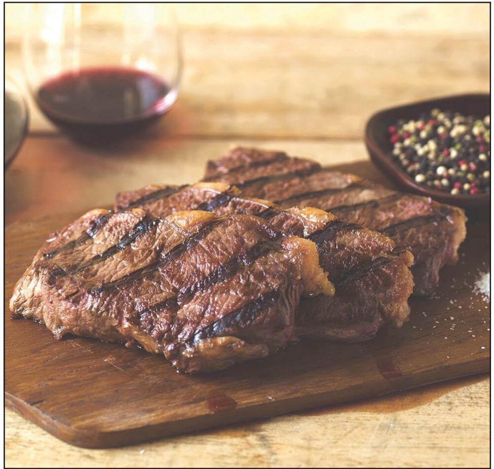
METRO CREATIVE CONNECTION

Imparting additional flavor to grilled foods can make this popular way to cook out even more enjoyable.